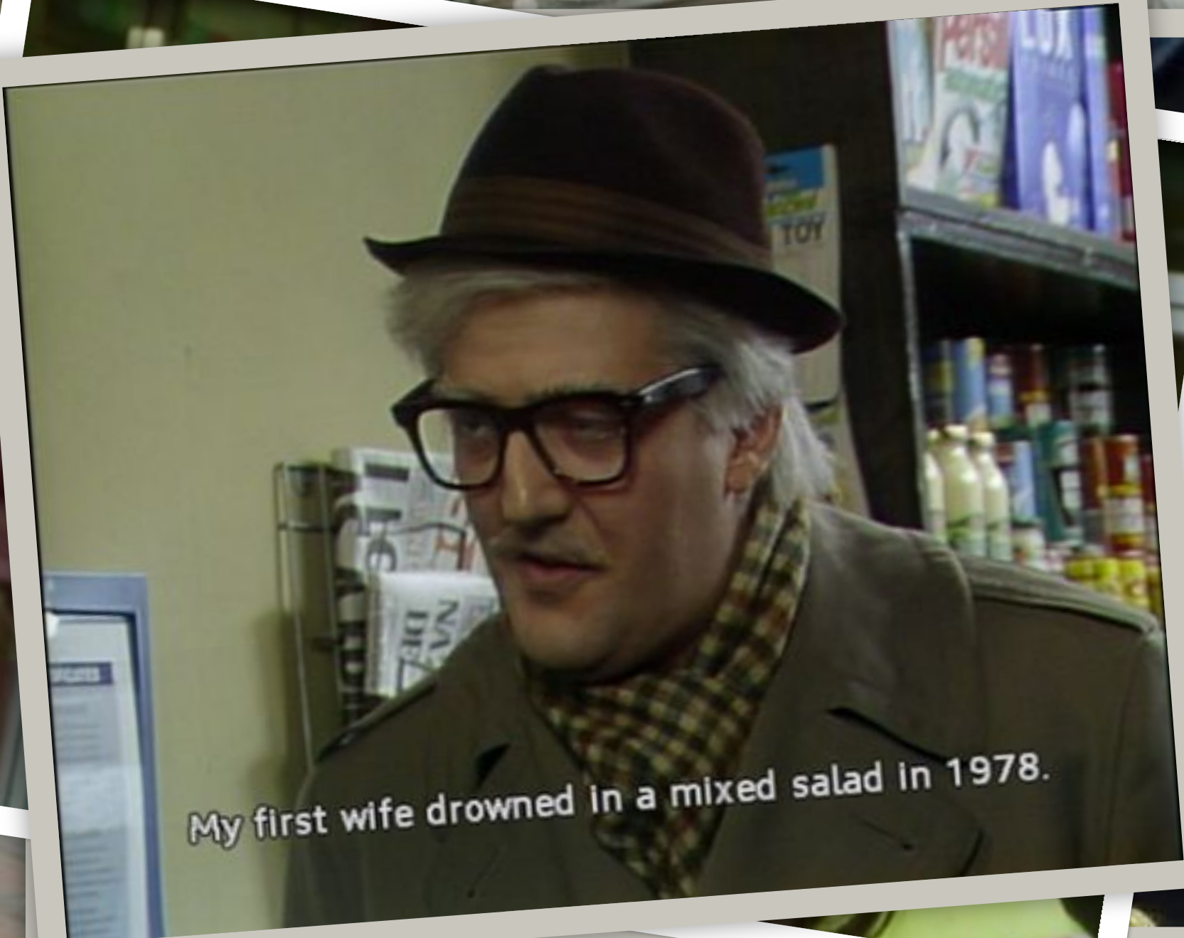
My first wife drowned in a mixed salad in 1978.