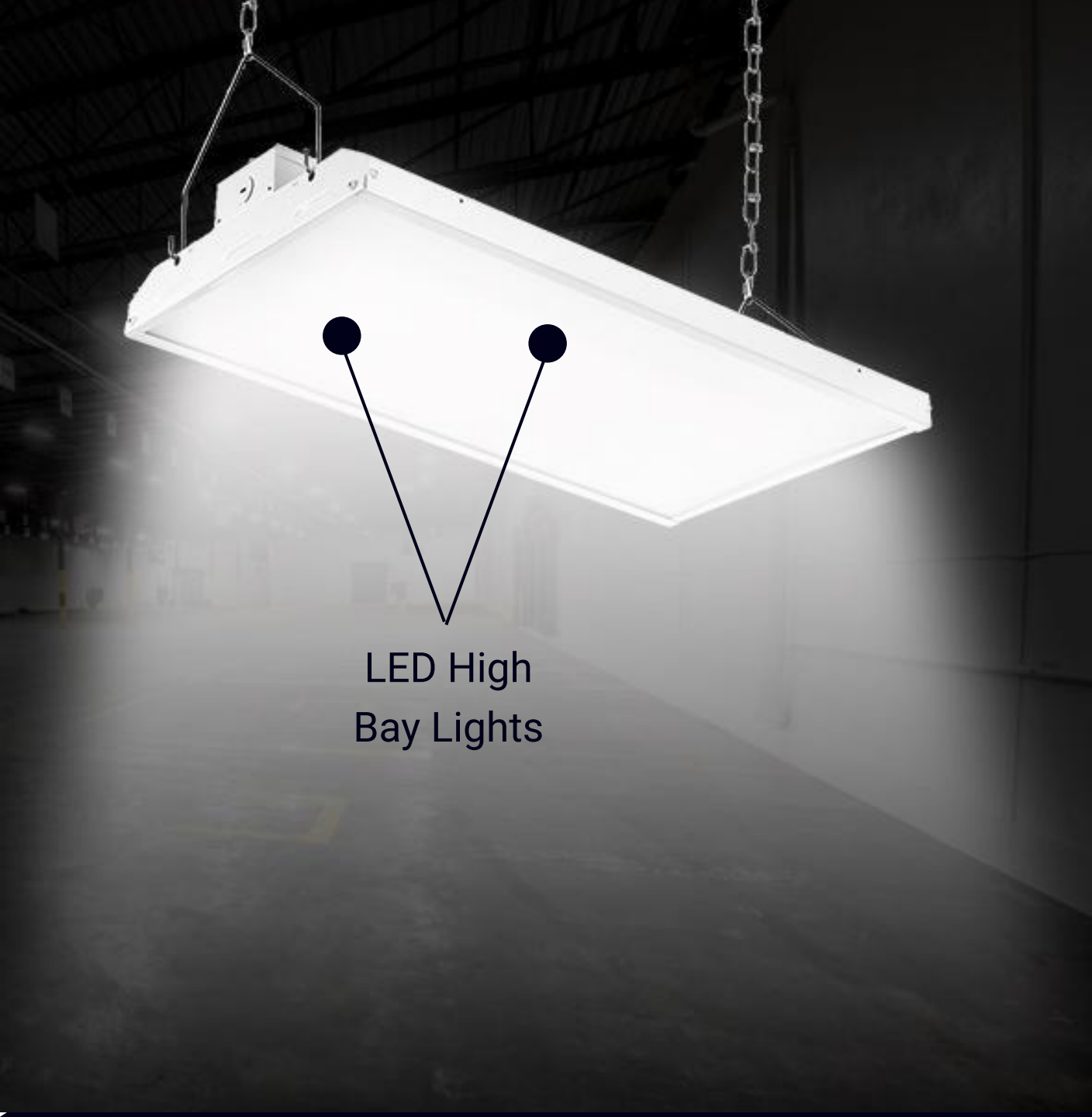
LED High Bay Lights