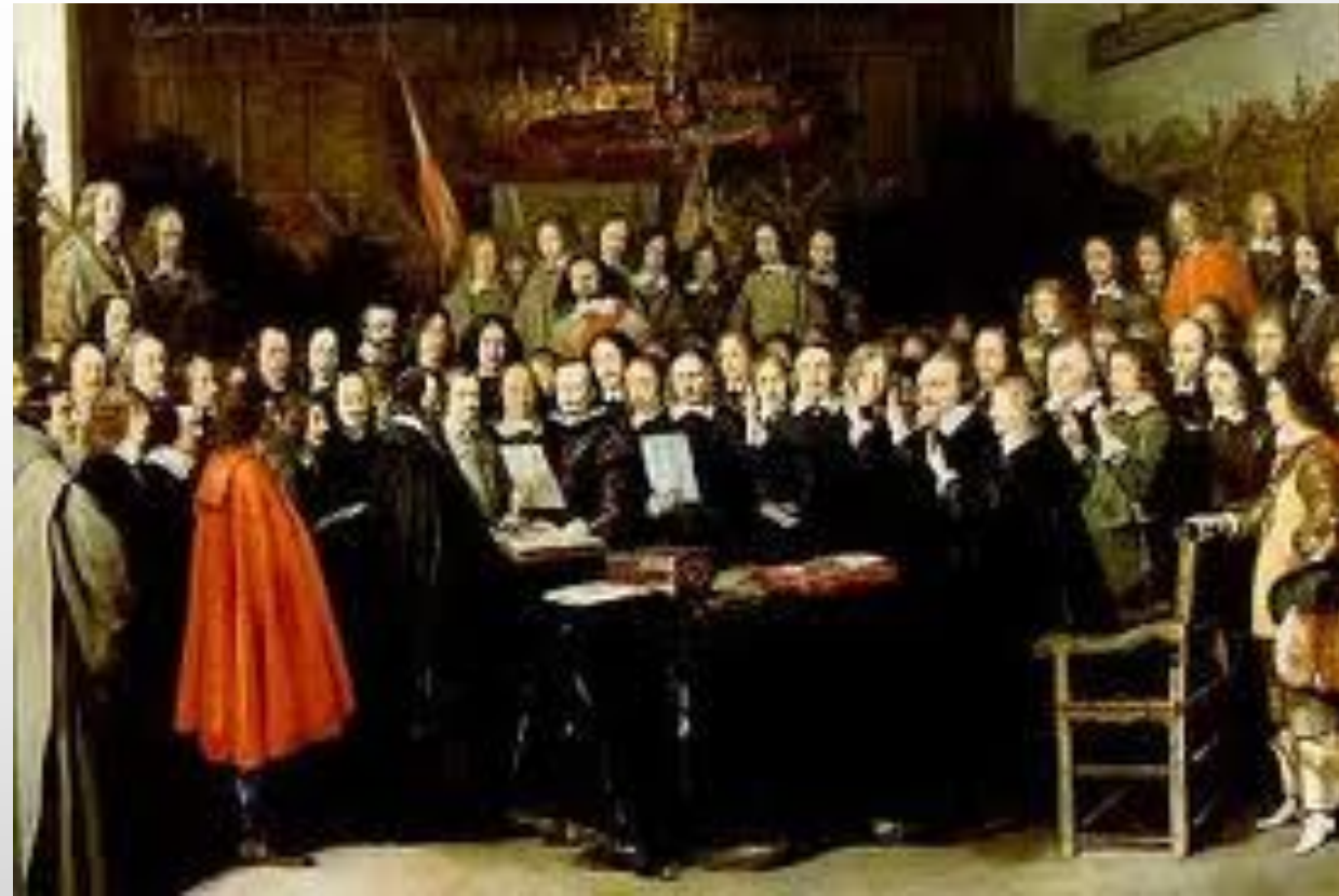
Painting of the Treaty being signed