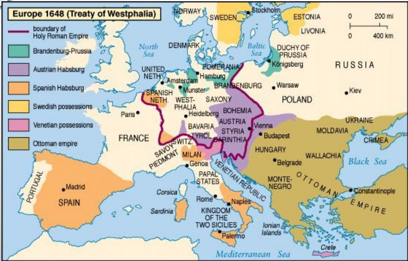
A map of Europe after the peace of Westphalia in 1648.