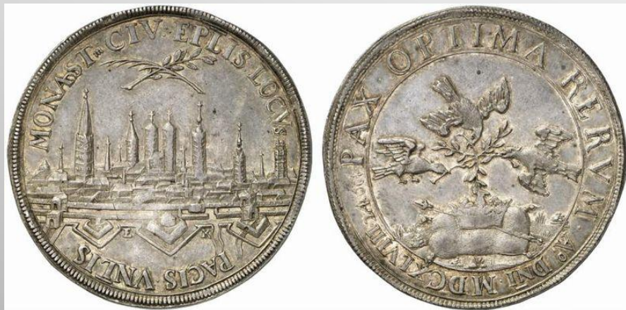
A medal celebrating the Treaty of Westphalia.