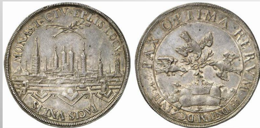
A medal celebrating the Treaty of Westphalia.