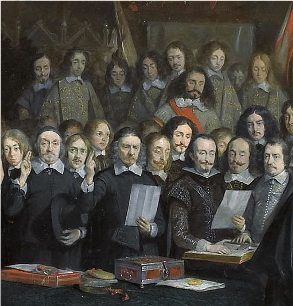
Rulers signing the Treaty of Westphalia