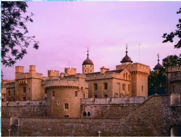
The Tower of London

served many purposes, medieval fortress amazing famous usually