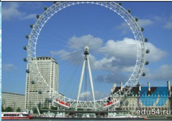
The London Eye

bird's eye view, the experience of a lifetime, thrilling, millennium