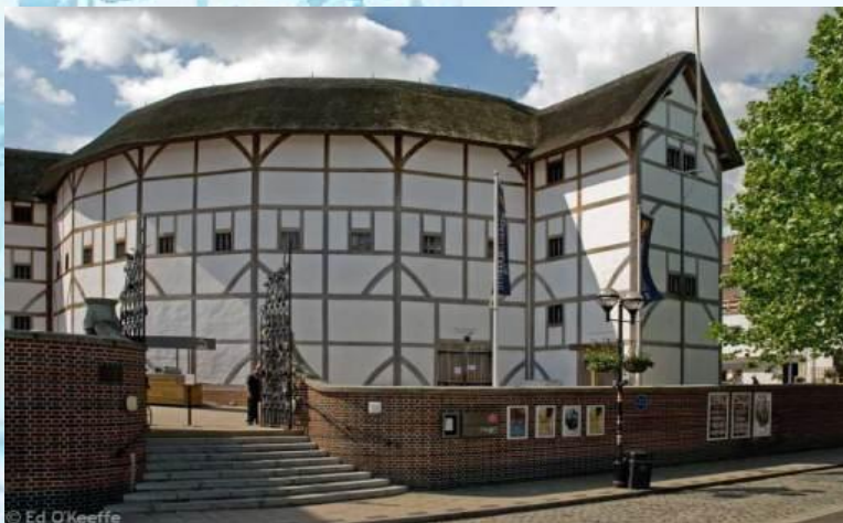
Shakespeare's Globe Theatre

burnt down performance it runs educational exhibition