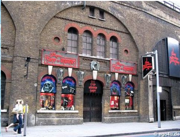
The London Dungeon

scared out of your wits faint-hearted thoroughly