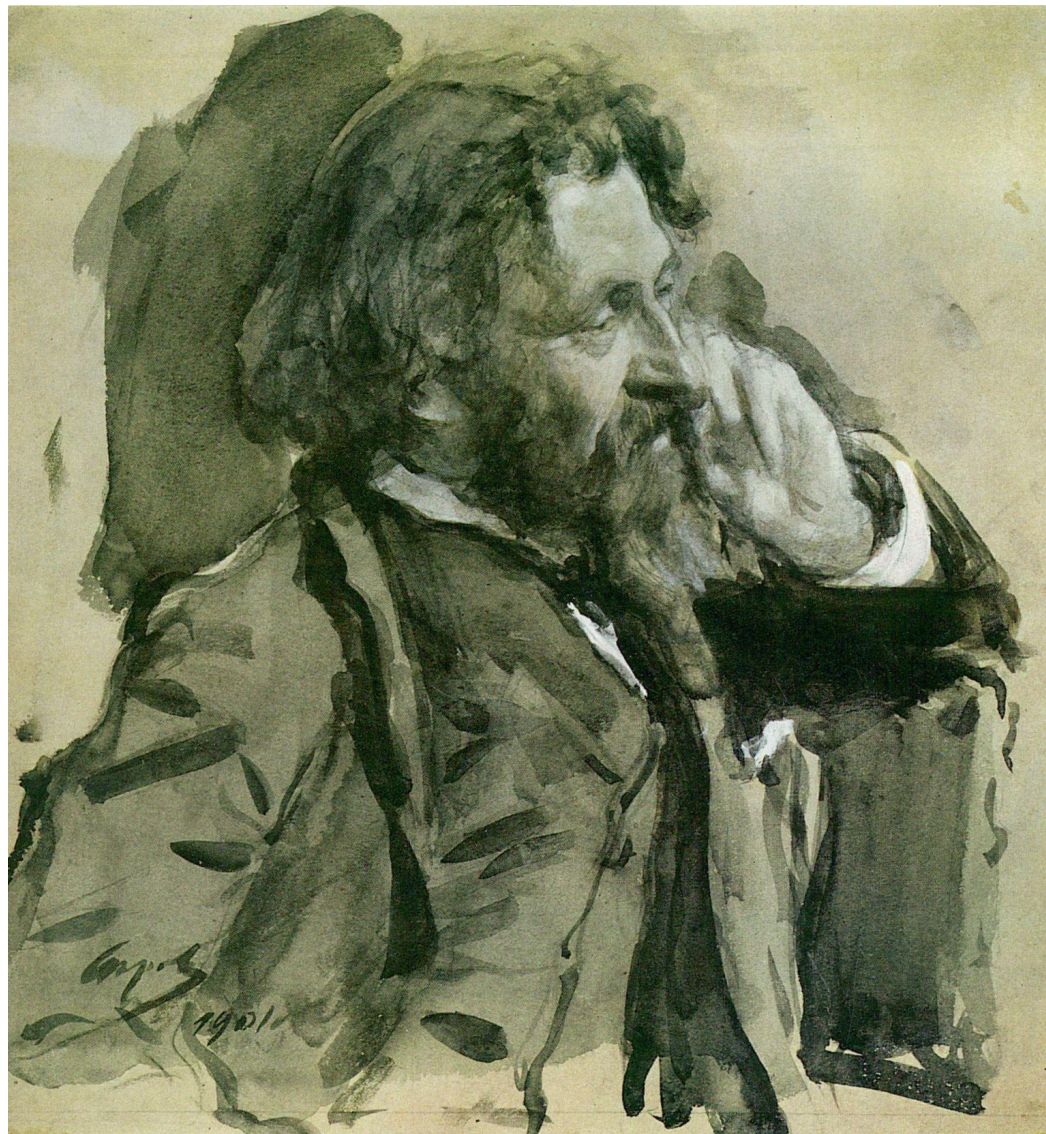
Valentin Serov "Portrait of Repin".