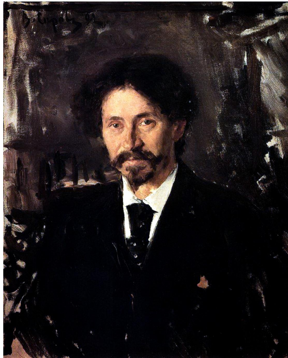
Valentin Serov "Portrait of Repin".