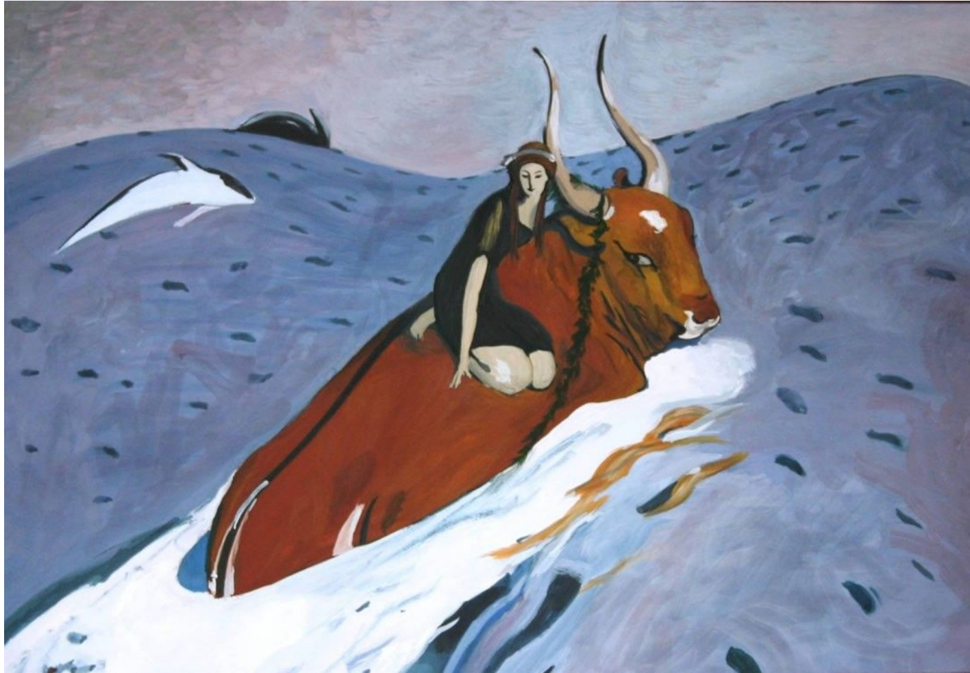
“The Rape of Europa” 1910, oil on canvas.