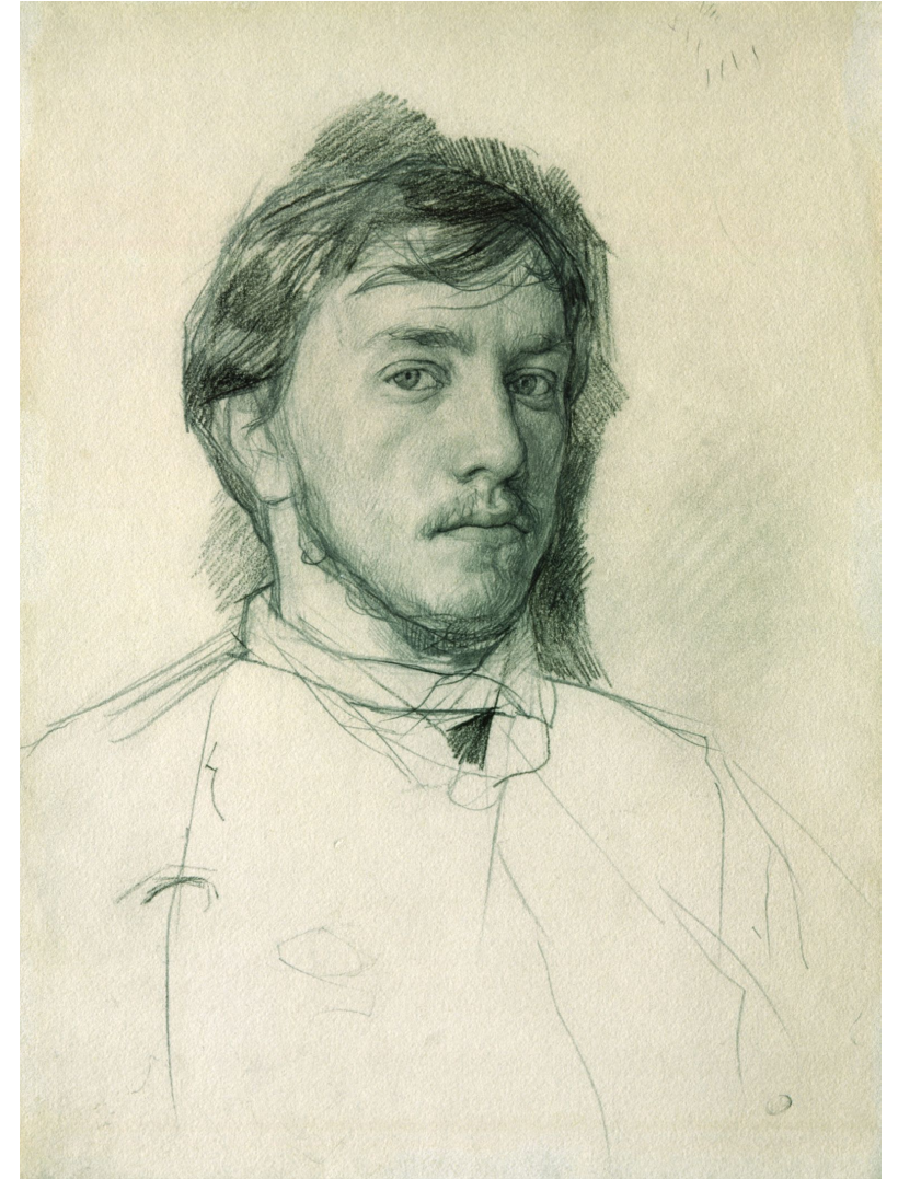
“Self-portrait”, Valentin Serov, paper, graphite pencil 1880s