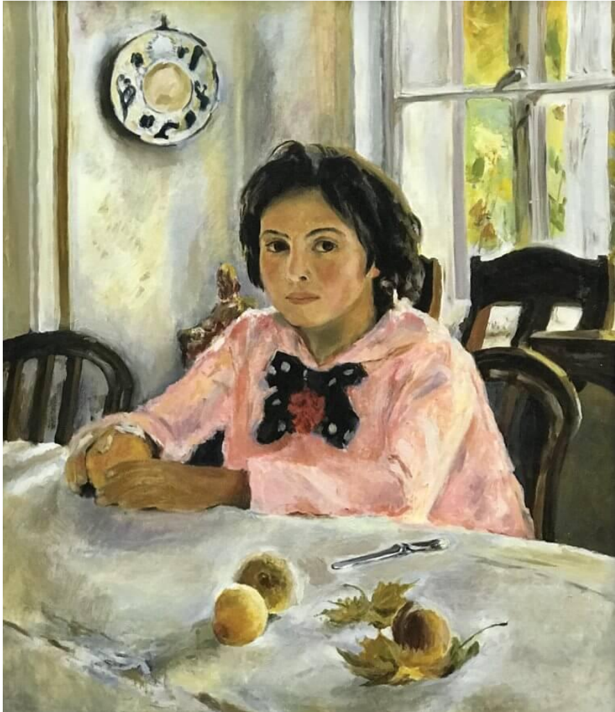
Valentin Serov “Girl with peaches”. 1887, oil on canvas.

His most recognizable work is his 1887 “Girl with Peaches.” This is a portrait of Vera Mamontova. The painting is now in the State Tretyakov Gallery in Moscow.