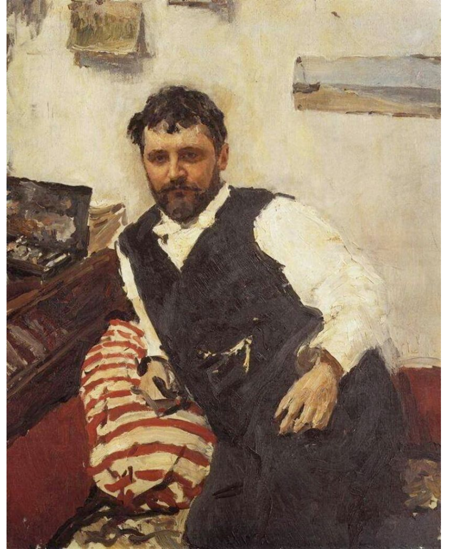
“Portrait of K. A. Korovin”, 1891, oil on canvas.

In this portrait of his painter friend, Serov uses earthy, dark colors in every part of the painting, except for the red and white striped pillow where Korovin rests his right arm. The color here was meant highlight Korovin as an artist and the brush in his right hand.