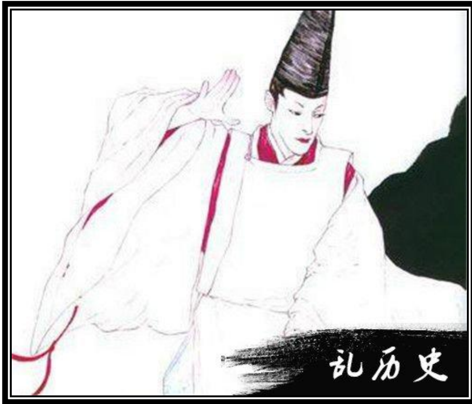
Onmyōji – professional practitioners of onmyōdō