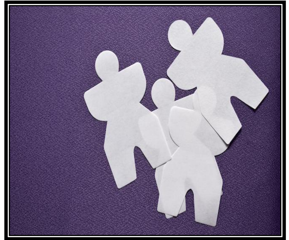
Paper dolls. Through them Onmyōji summon Shikigami, spirits conjured to exercise risky orders for their masters, such as protection from Yūrei.