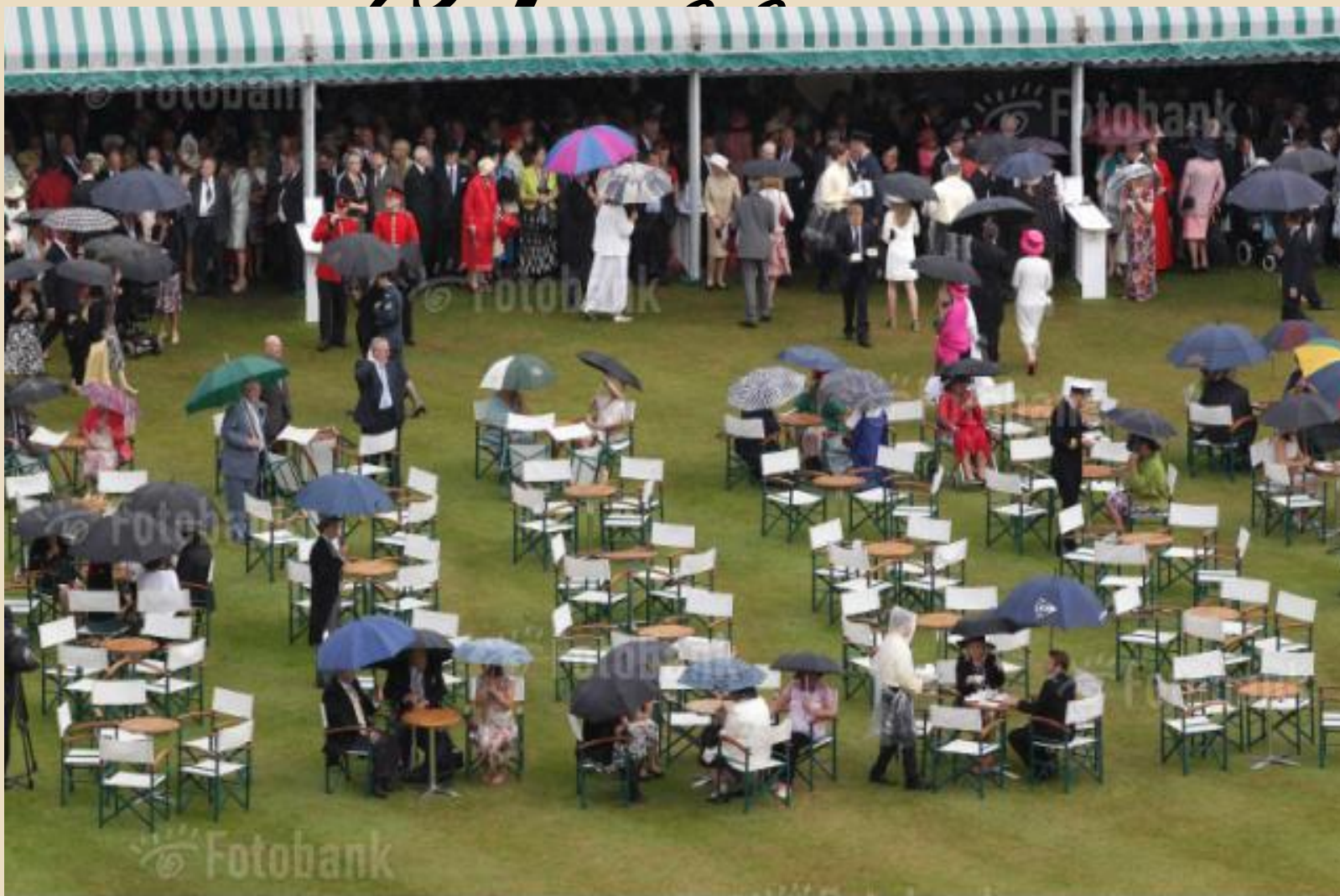
WWW.FOTOBANK.RU N019-2596 Getty Images News EO Королевский прием в саду Букингемского дворца, Лондон, 19 июля 2011.