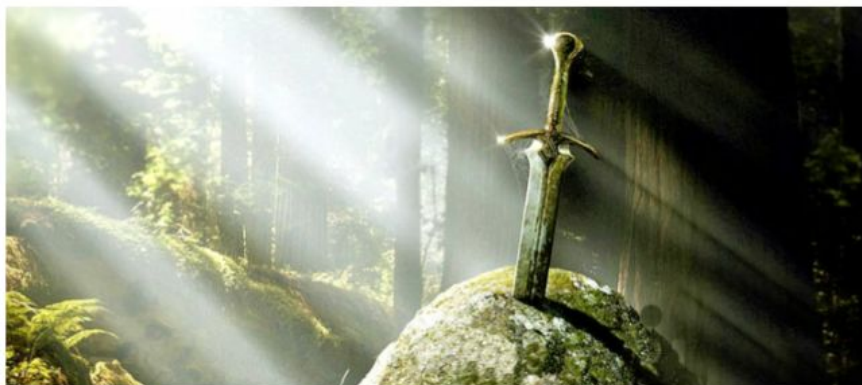
pull out - вытаскивать

To put an end to the fighting Merlin created a contest to choose the new king. He stuck the magic sword, Excalibur, into a large stone and said that only the true King could pull it out*.