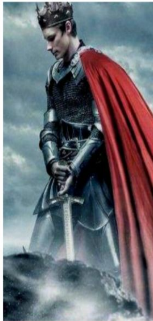
to fail - терпеть неудачу

All the strongest men in the land tried to free the sword but failed*. Then Arthur, who was looking for a sword for a local tournament, saw the sword and lifted it out easily. He became king and made Merlin his special advisor.