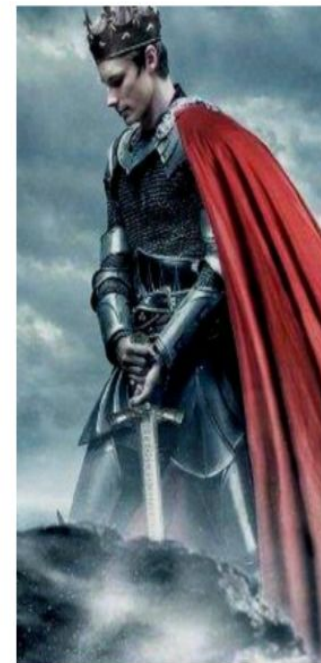
to fail - терпеть неудачу

All the strongest men in the land tried to free the sword but failed*. Then Arthur, who was looking for a sword for a local tournament, saw the sword and lifted it out easily. He became king and made Merlin his special advisor.