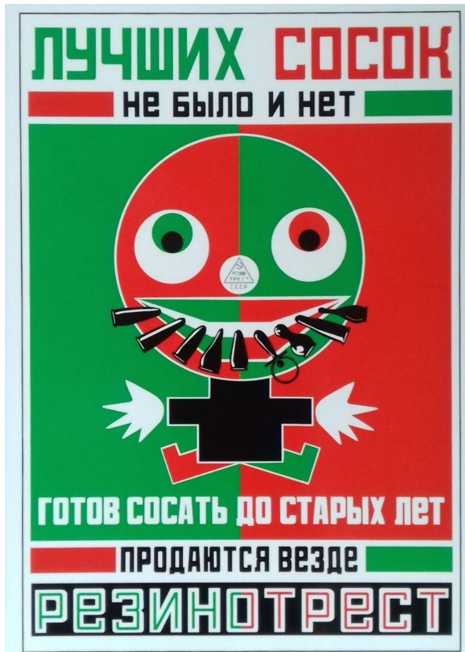
Маяковский В, Родченко А, Реклама Резинотреста, Плакат 1923 г.