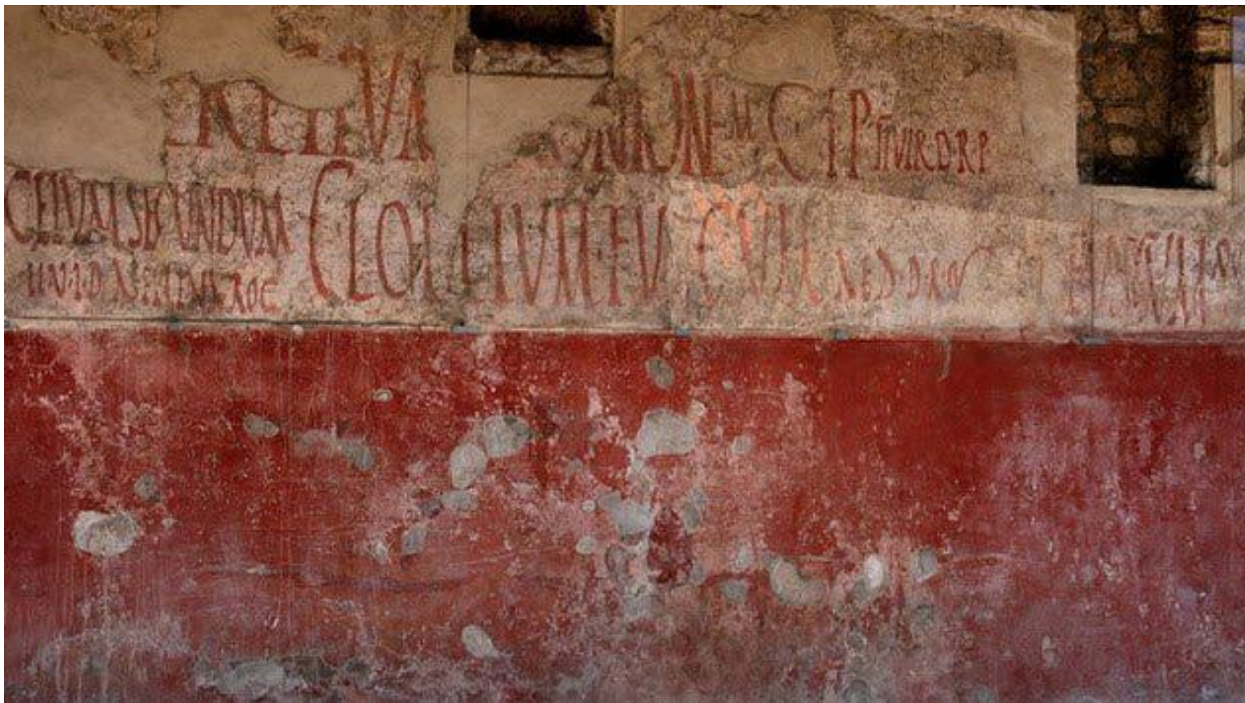
Избирательная реклама, Древний Рим, Помпеи