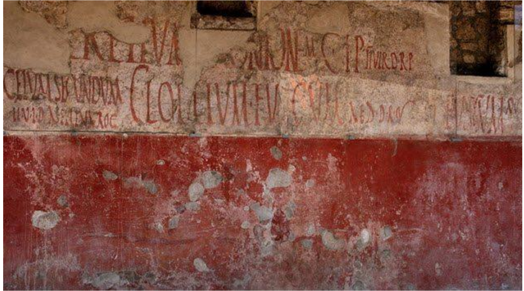
Избирательная реклама, Древний Рим, Помпеи