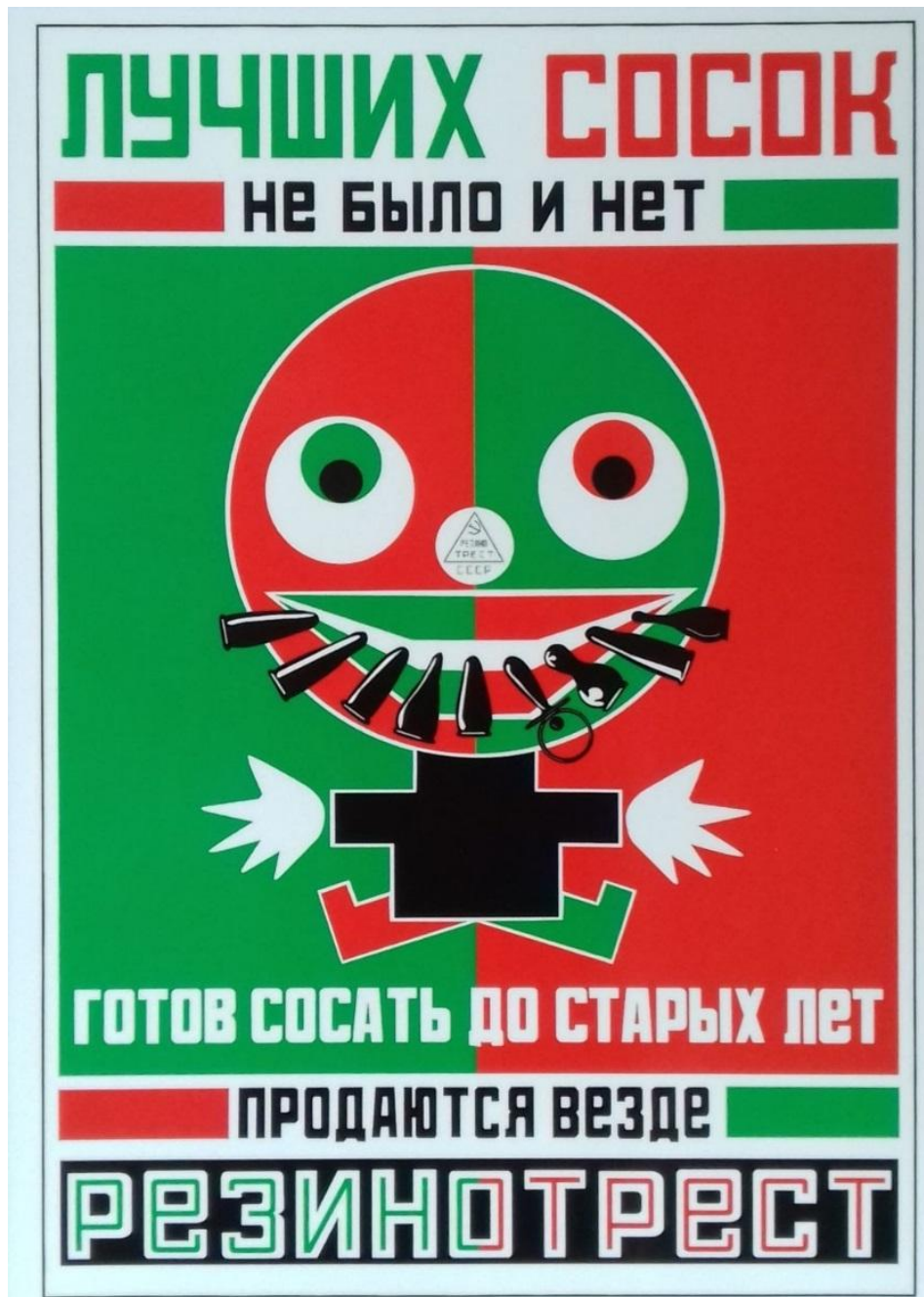
Маяковский В, Родченко А, Реклама Резинотреста, Плакат 1923 г.