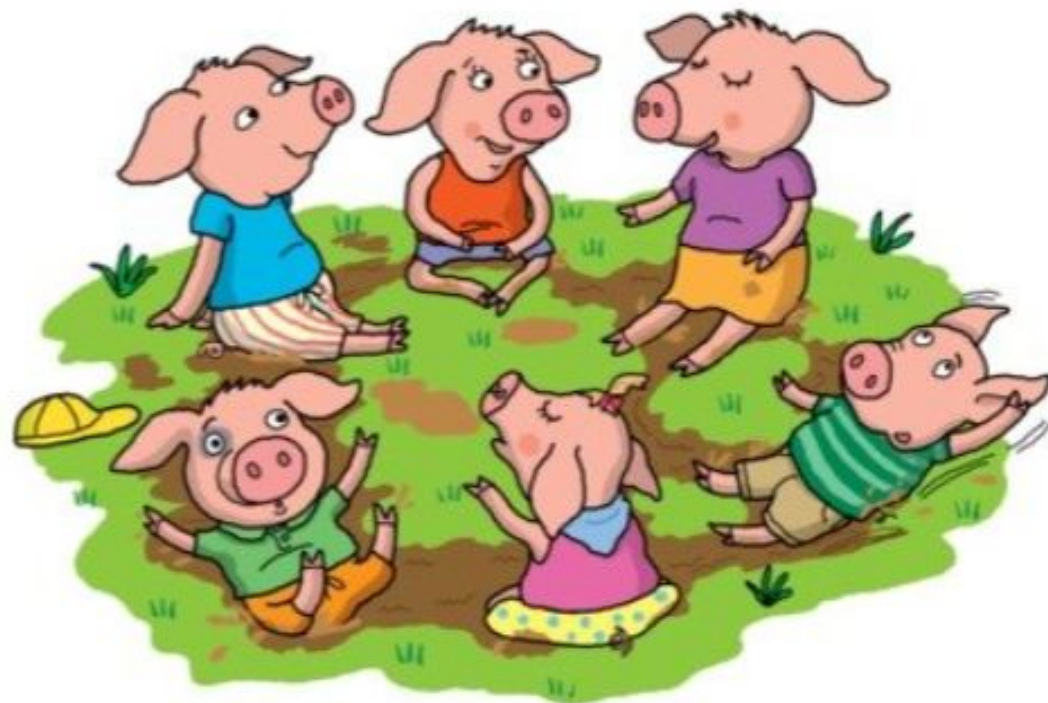
Six big pigs sit in the mud.