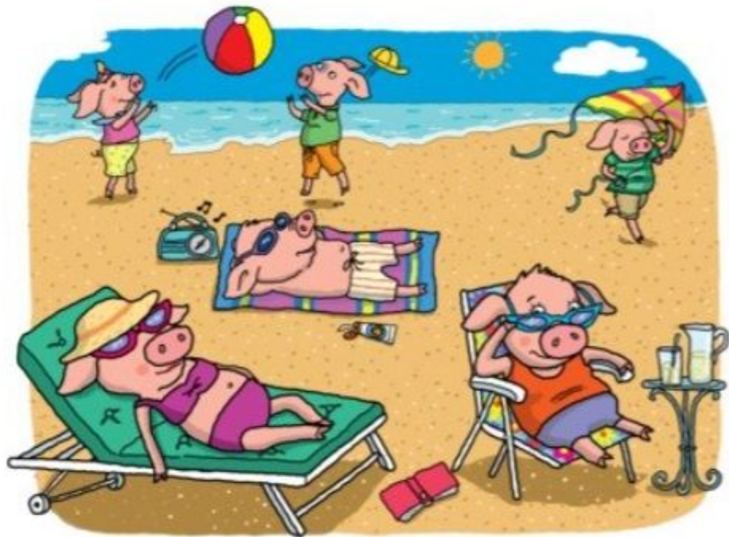
Six big pigs in the sun.