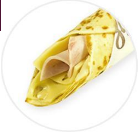
ham and cheese