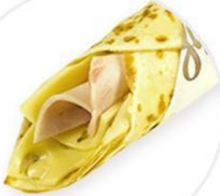
ham and cheese