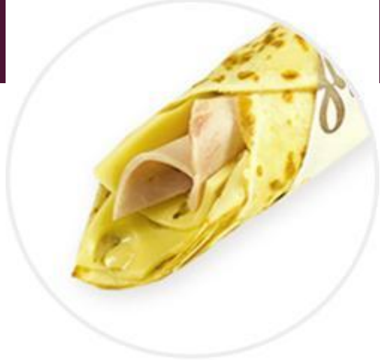
ham and cheese