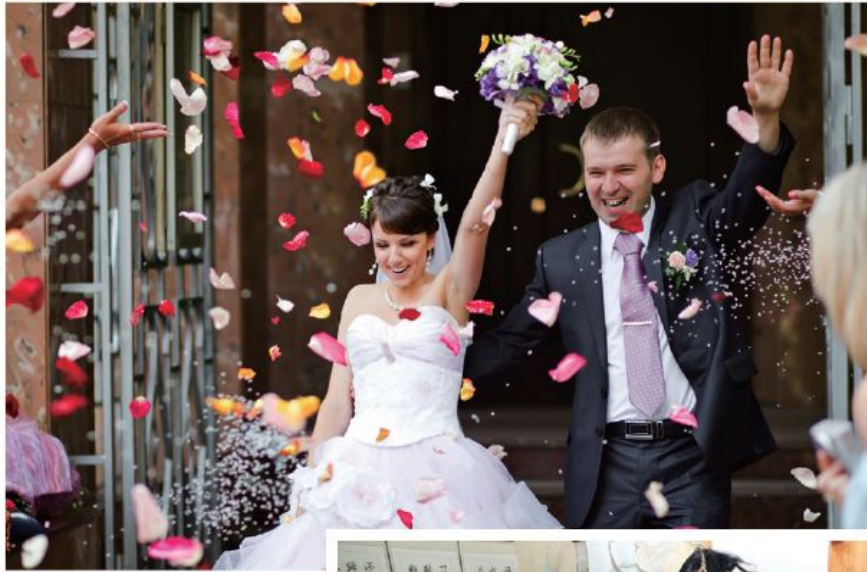
◀ Western brides traditionally wear white.