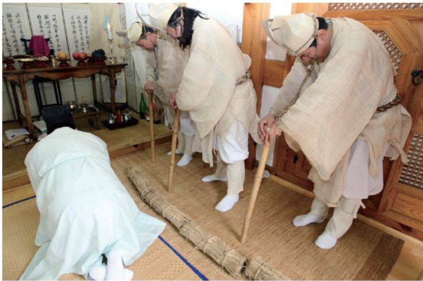
▶ People from some Asian cultures wear white at a funeral.