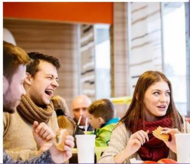
at the fast food restaurant