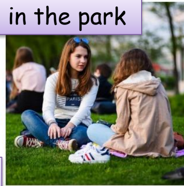
in the park