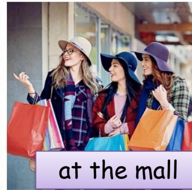
at the mall