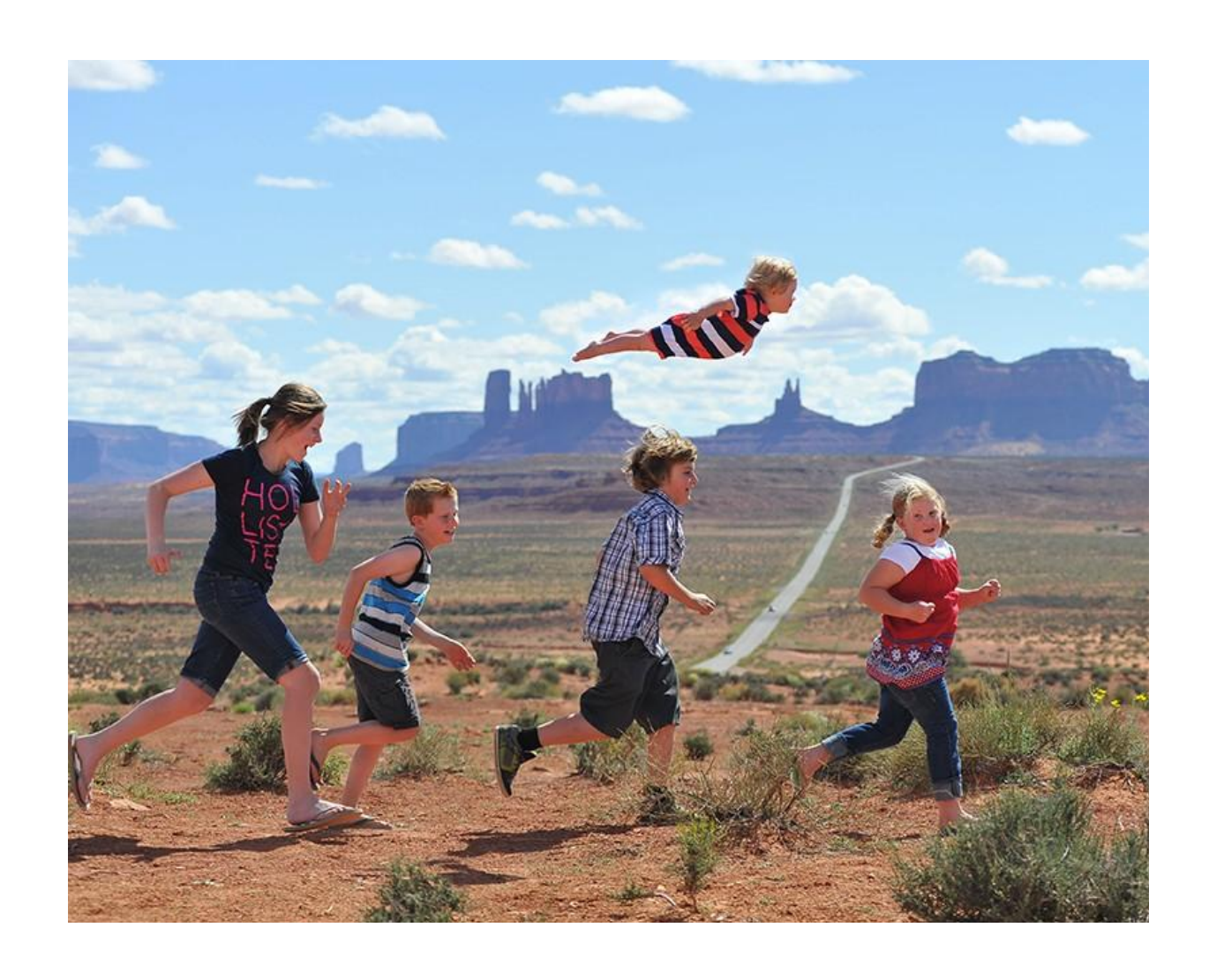
He can fly.