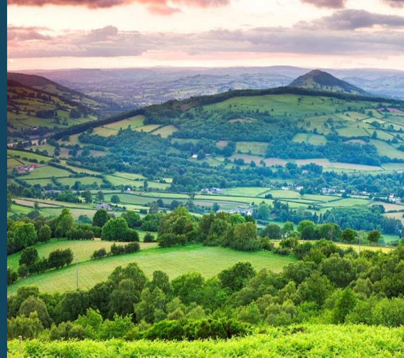
National Park: Pembrokeshire Coast