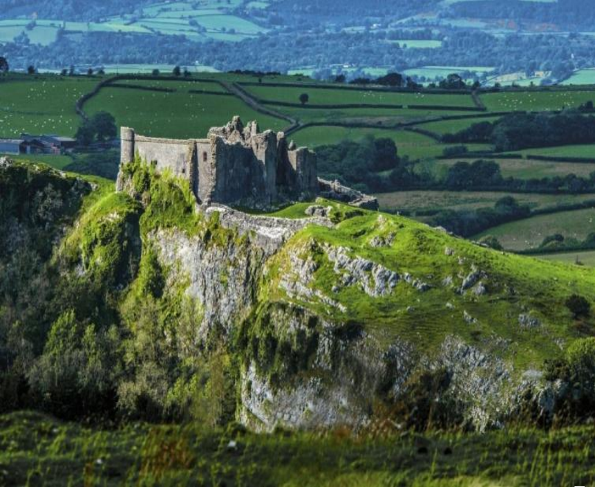
National Park: Brecon .