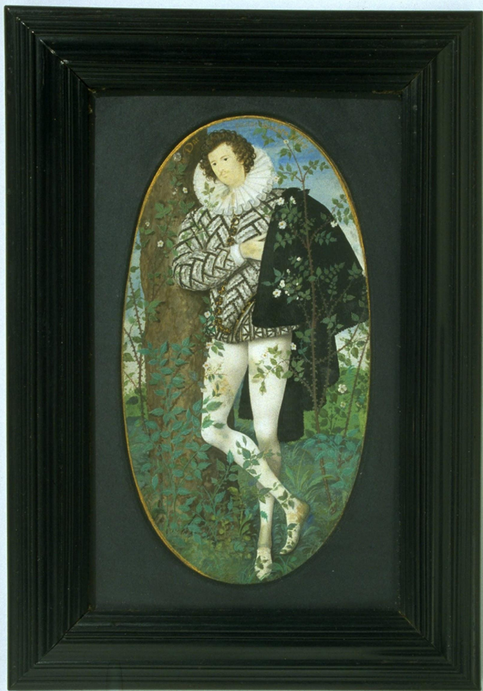
An Unknown Youth Leaning Against a Tree Among Roses