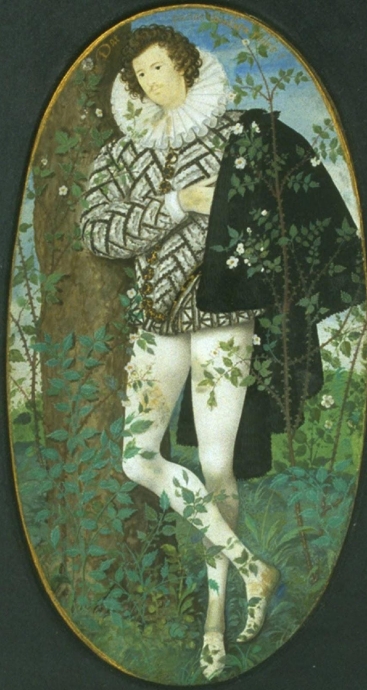
An Unknown Youth Leaning Against a Tree Among Roses