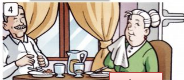
Grandma and Grandpa 've finished dinner.