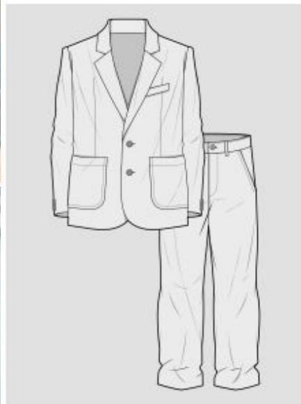
Tailoring A/W 19/20