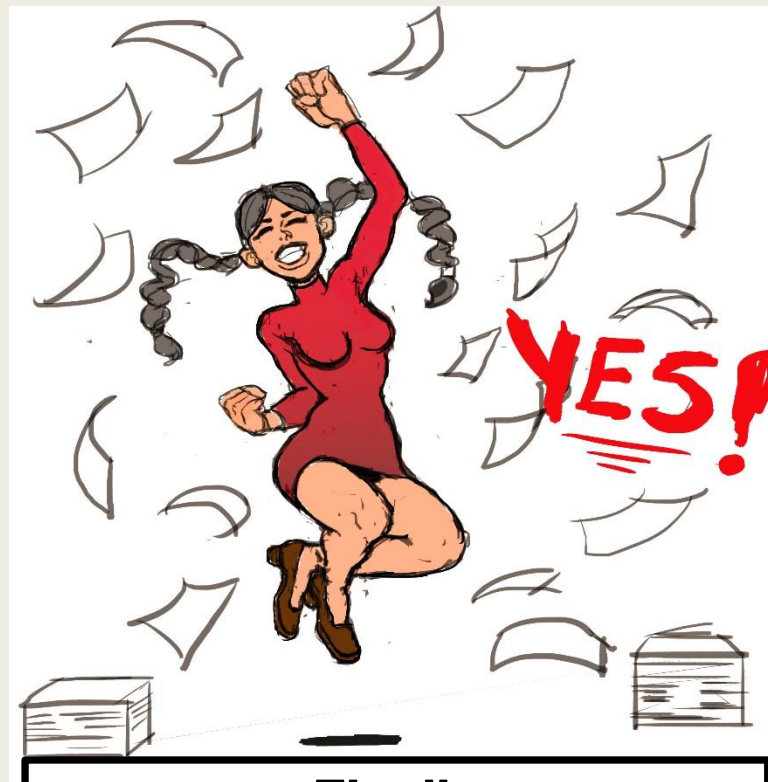
Finally /'faɪnəli/ наконец