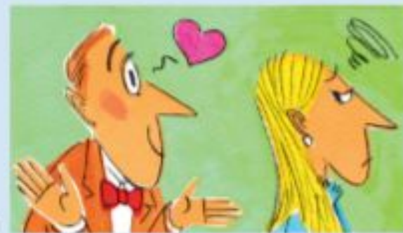
He loves her but she doesn't love him.