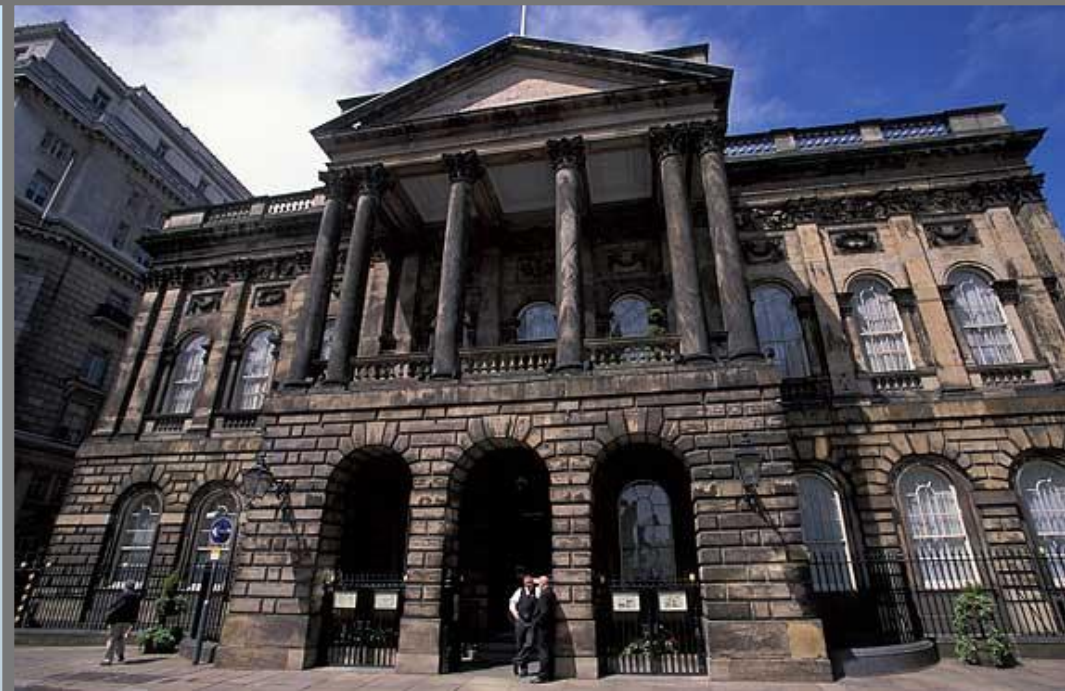
Town Hall on Castle St (1754).

St. George's Hall (1854) is situated in Lime Street. It is the most beautiful building in Liverpool. It has a concert hall, where is situated a huge organ. Charles Dickens read his stories here.