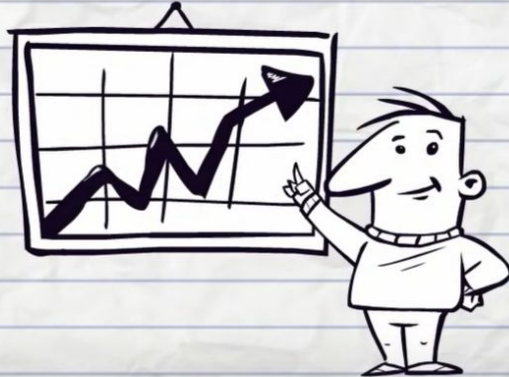
chart shows our profit.