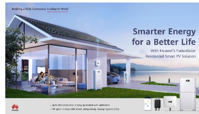
Banner 2 (aprox. 2.5x4.5 m)