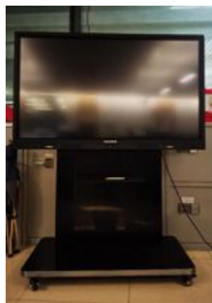
Screen with stand

Inverter must be held on the wall The battery, need to make a wall-like holder (1.5x1 m)