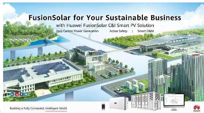
Banner 1 (aprox. 2.5x4.5 m)