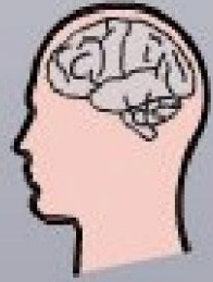
How the brain works