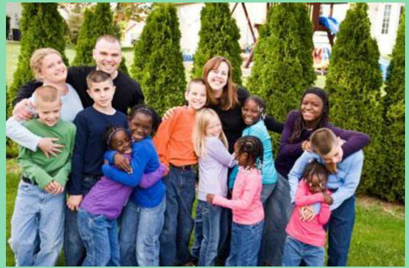
Adoptive (foster) family