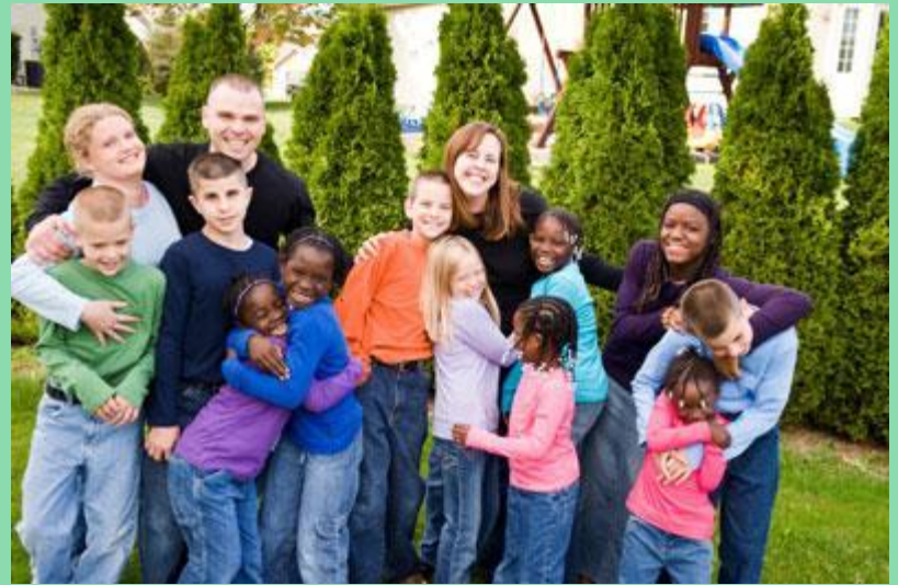
Adoptive (foster) family