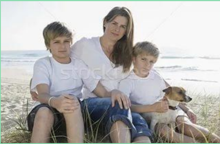
Single – parent family