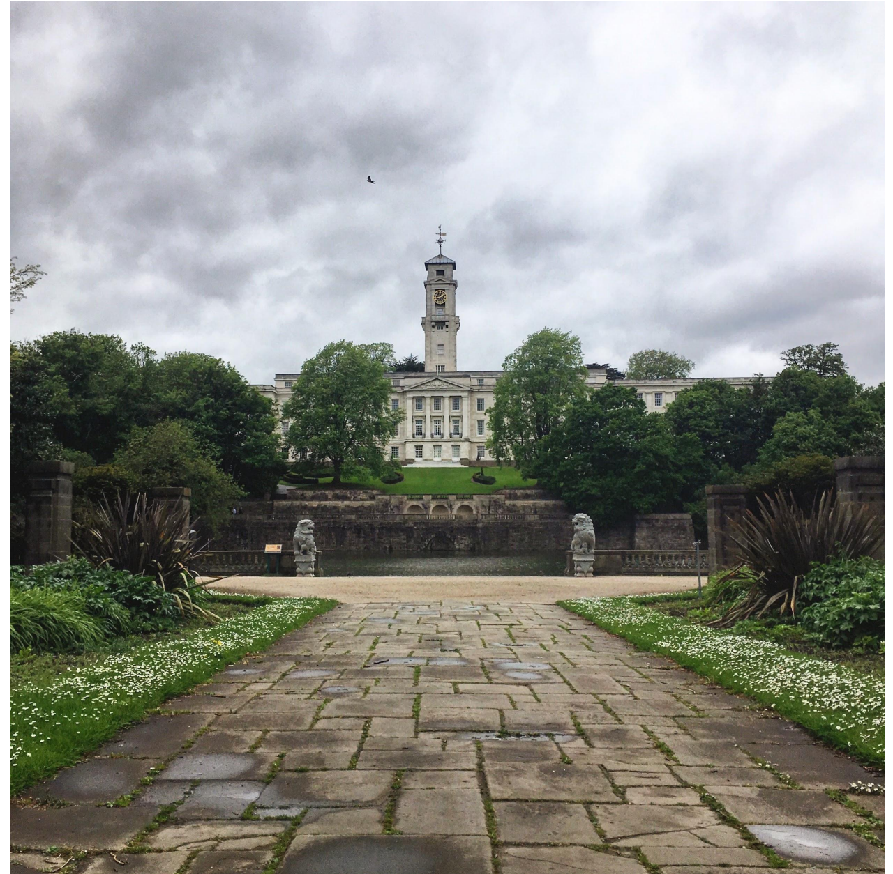
The University of Nottingham, England