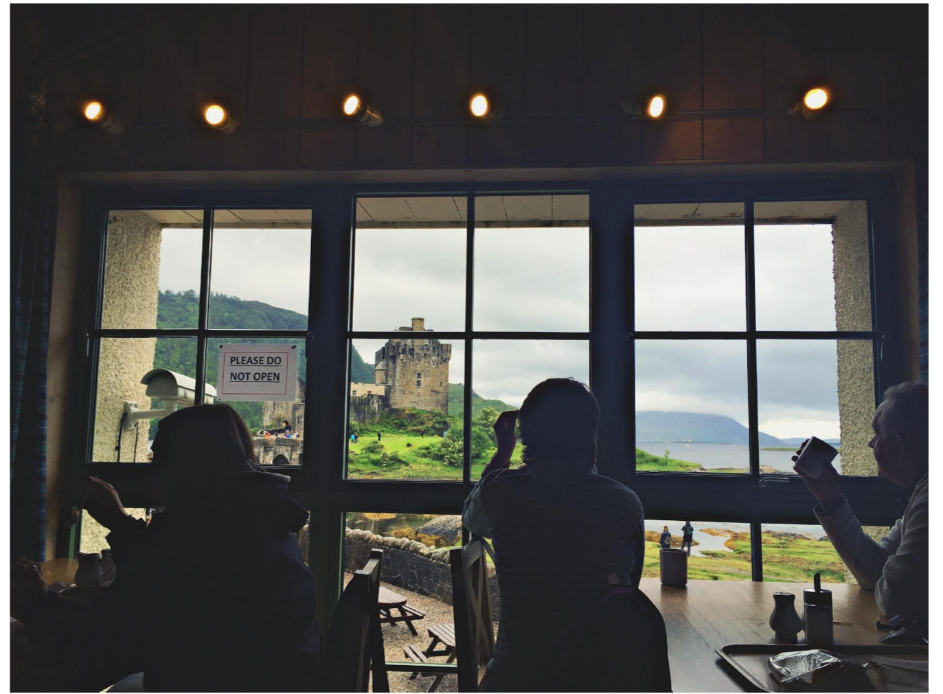
Doune Castle, Scotland