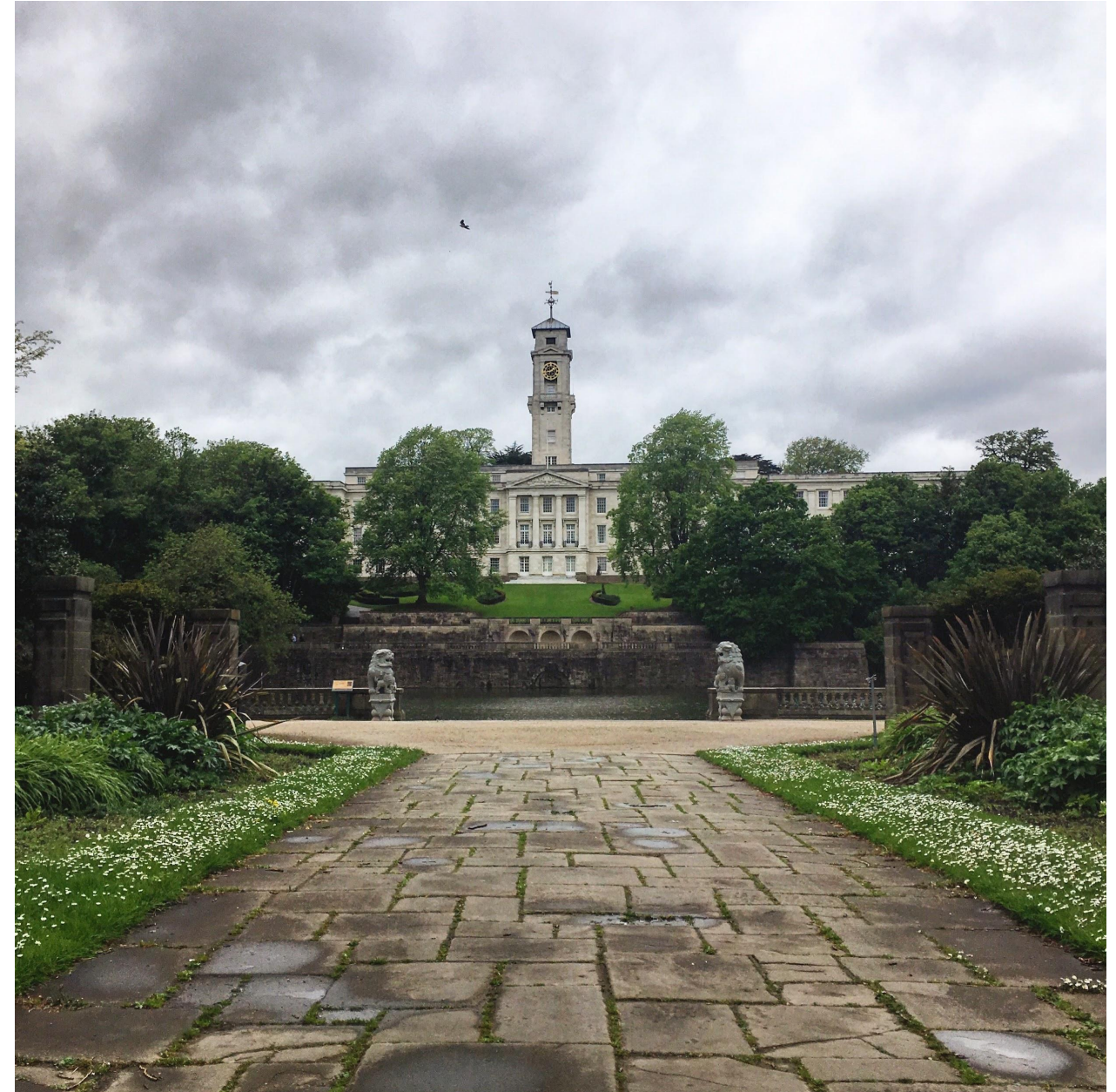
The University of Nottingham, England