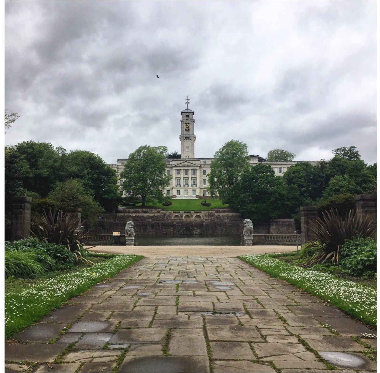
The University of Nottingham, England