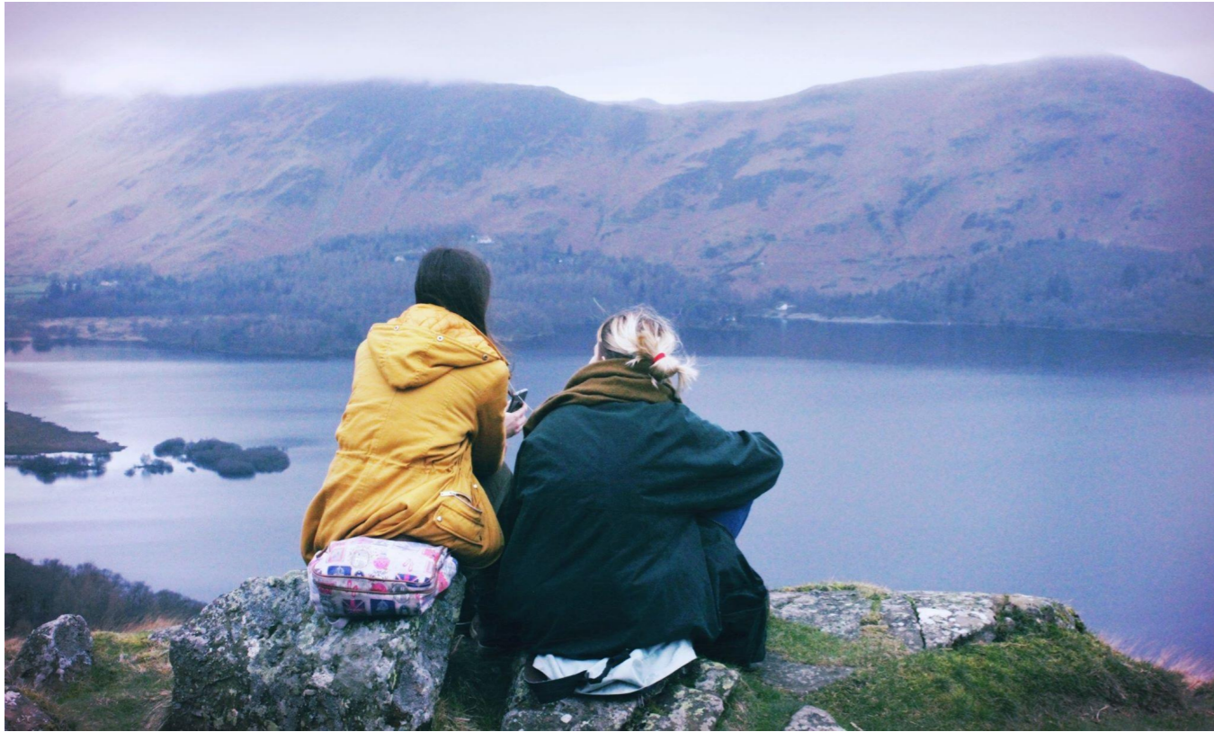
Lake District, England