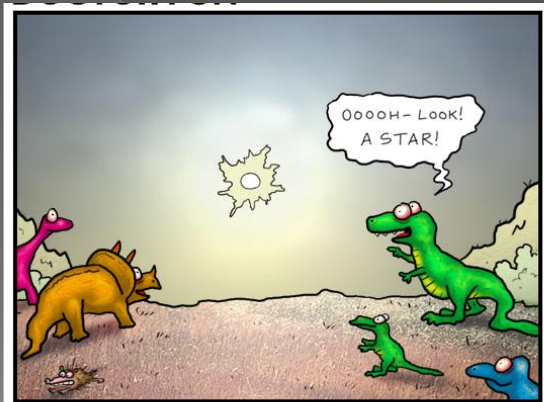
A Cretaceous Christmas