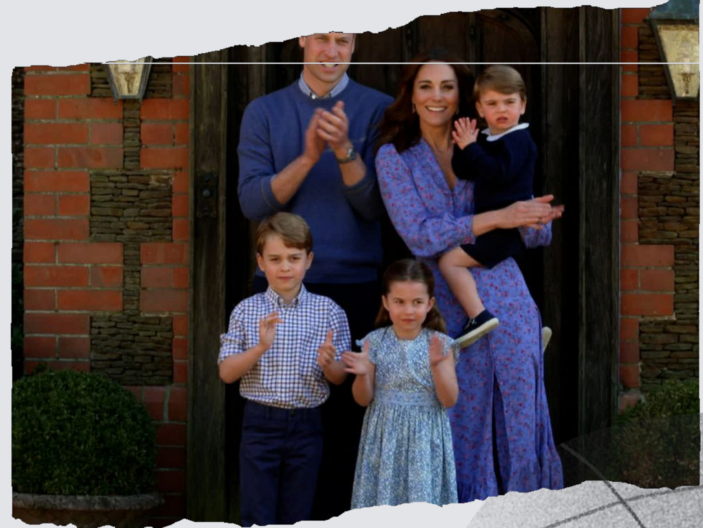
IMAGE The "Prince George effect", sometimes known as the "royal baby effect", is a term used to describe an uptick in sales of clothing and other products used by George.