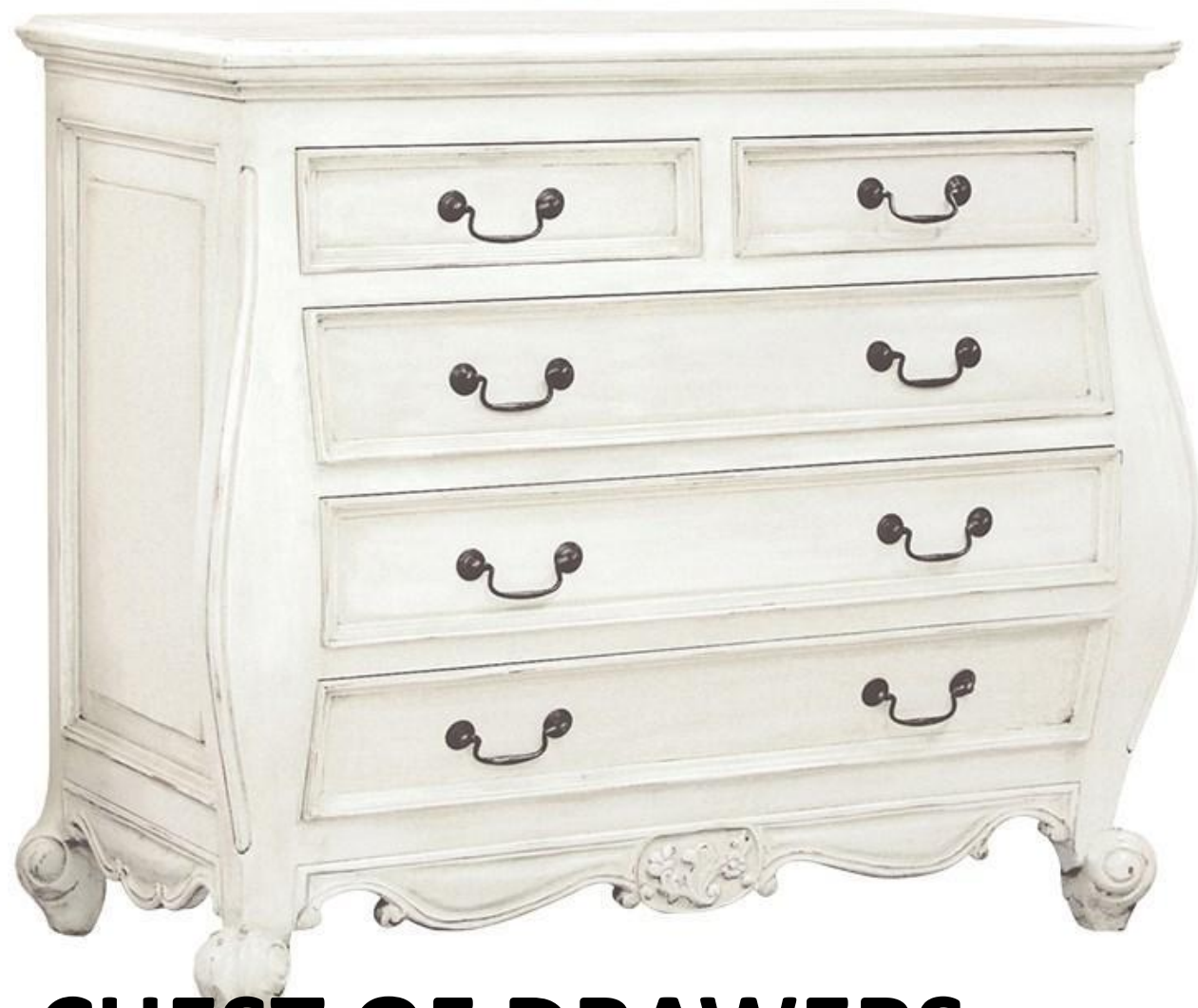
A CHEST OF DRAWERS