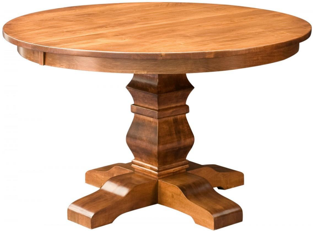
A TABLE TABLE