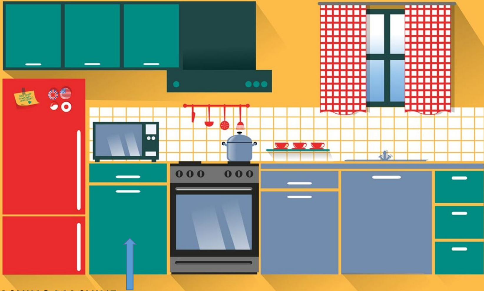
a WASHING MACHINE