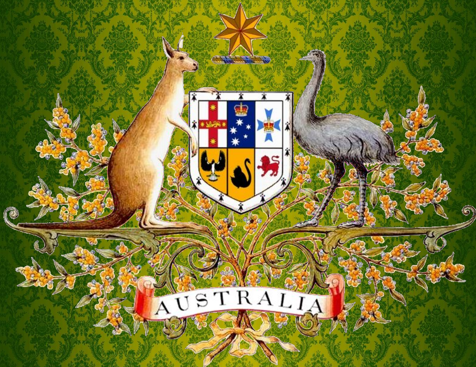
the Red Kangaroo and the Emu