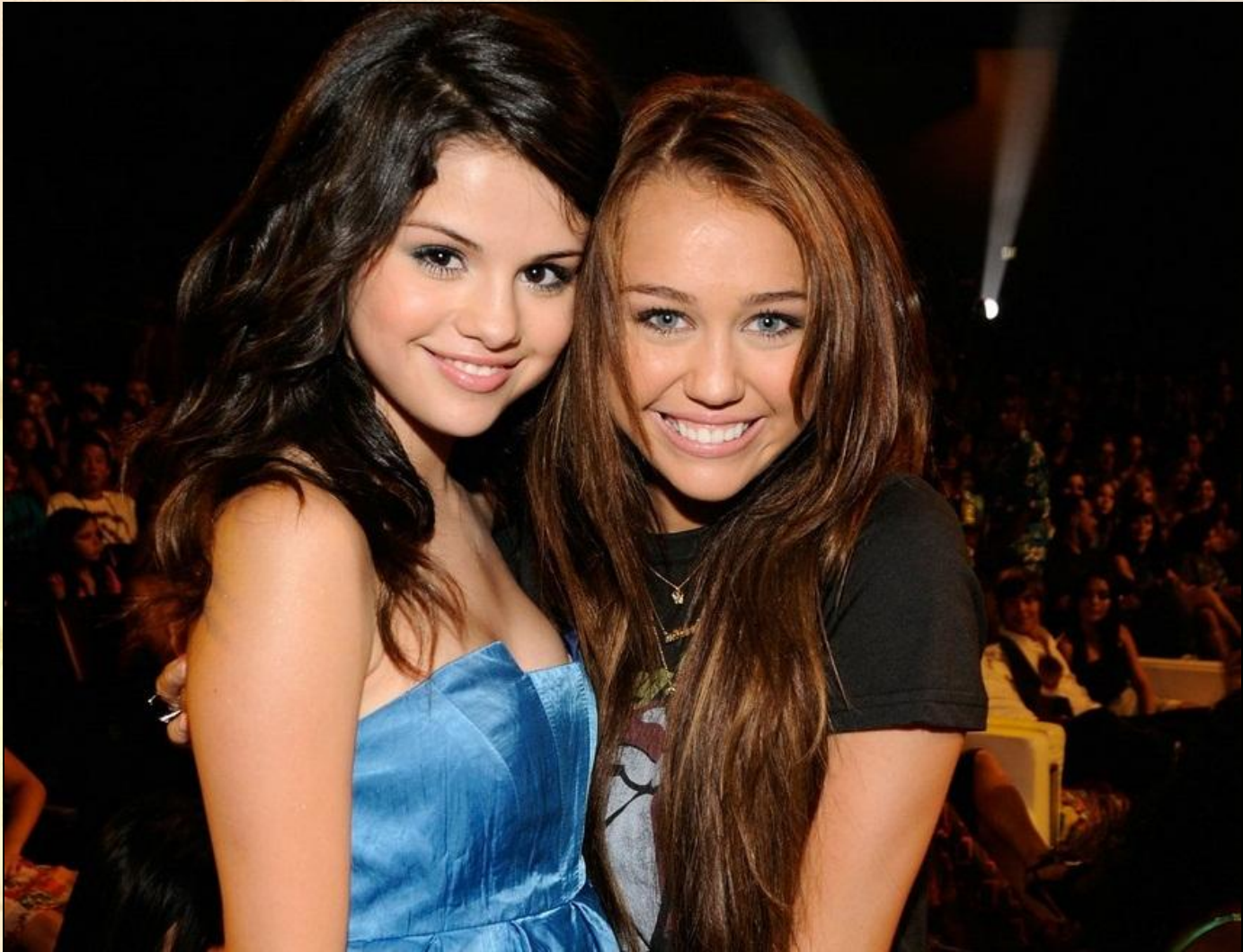
Selena Gomez and Miley Cyrus