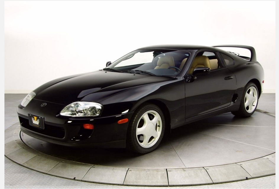
Toyota Supra(Japanese sportcar)