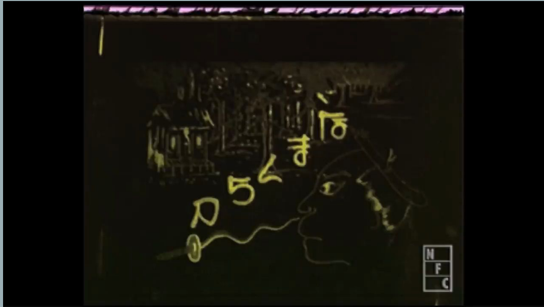
A frame from anime “Namakura Gatana” (1917)