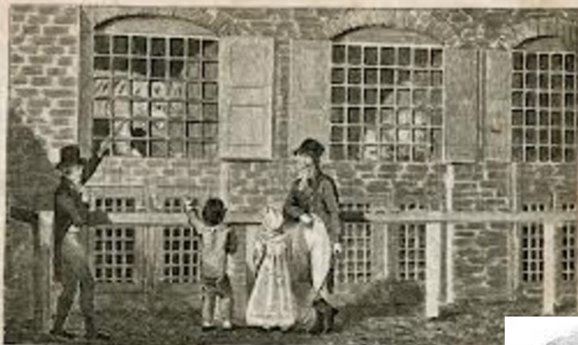
The Menagerie in the Tower.