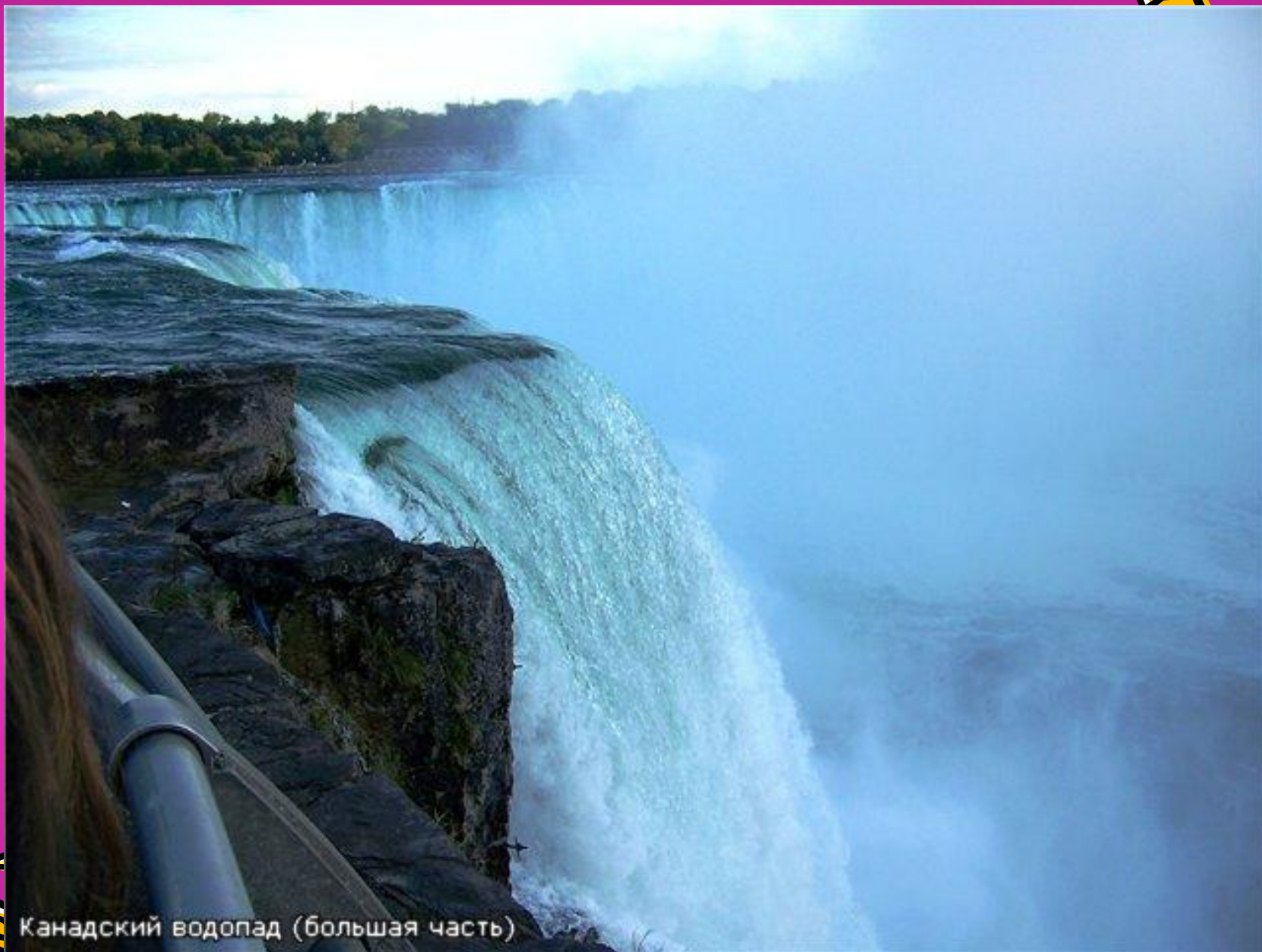
Канадский водопад (большая часть)