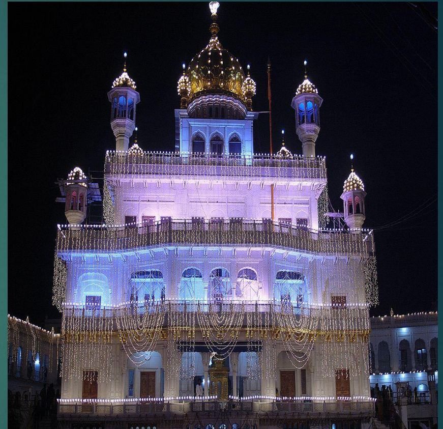
Harmandir sahib complex,amritsar

Their birthdays ,known as gurupurab ,are occasions for celebration and prayer among the Sikhs.