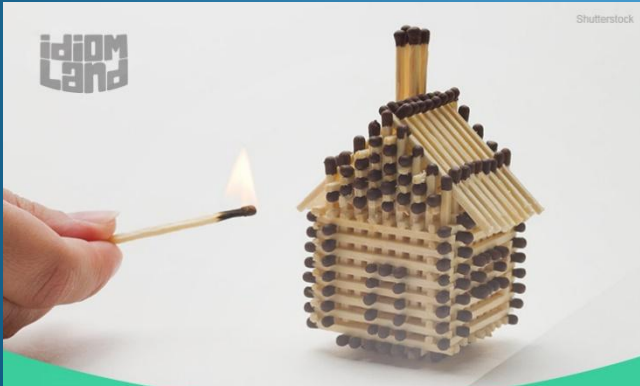
IDIOMLAND.COM GET ON LIKE A HOUSE ON FIRE