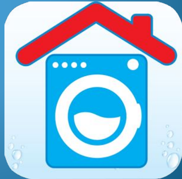
Home and dry