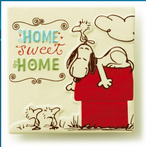
A home from home