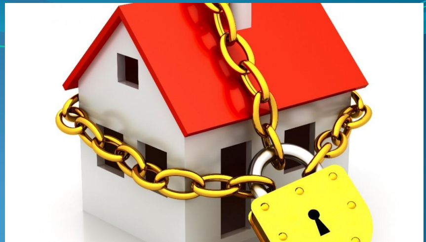
As safe as houses