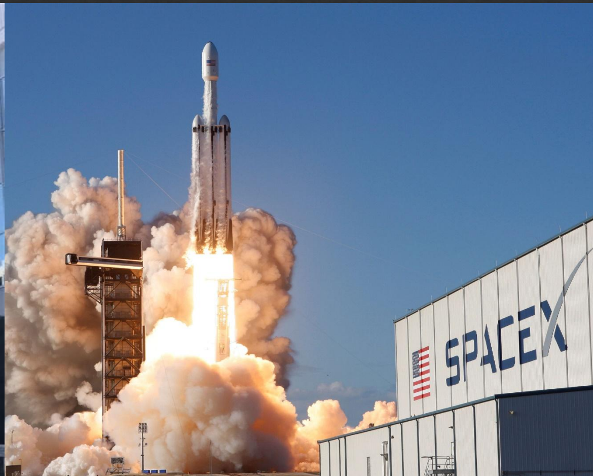
“SpaceX” office and launch pad.