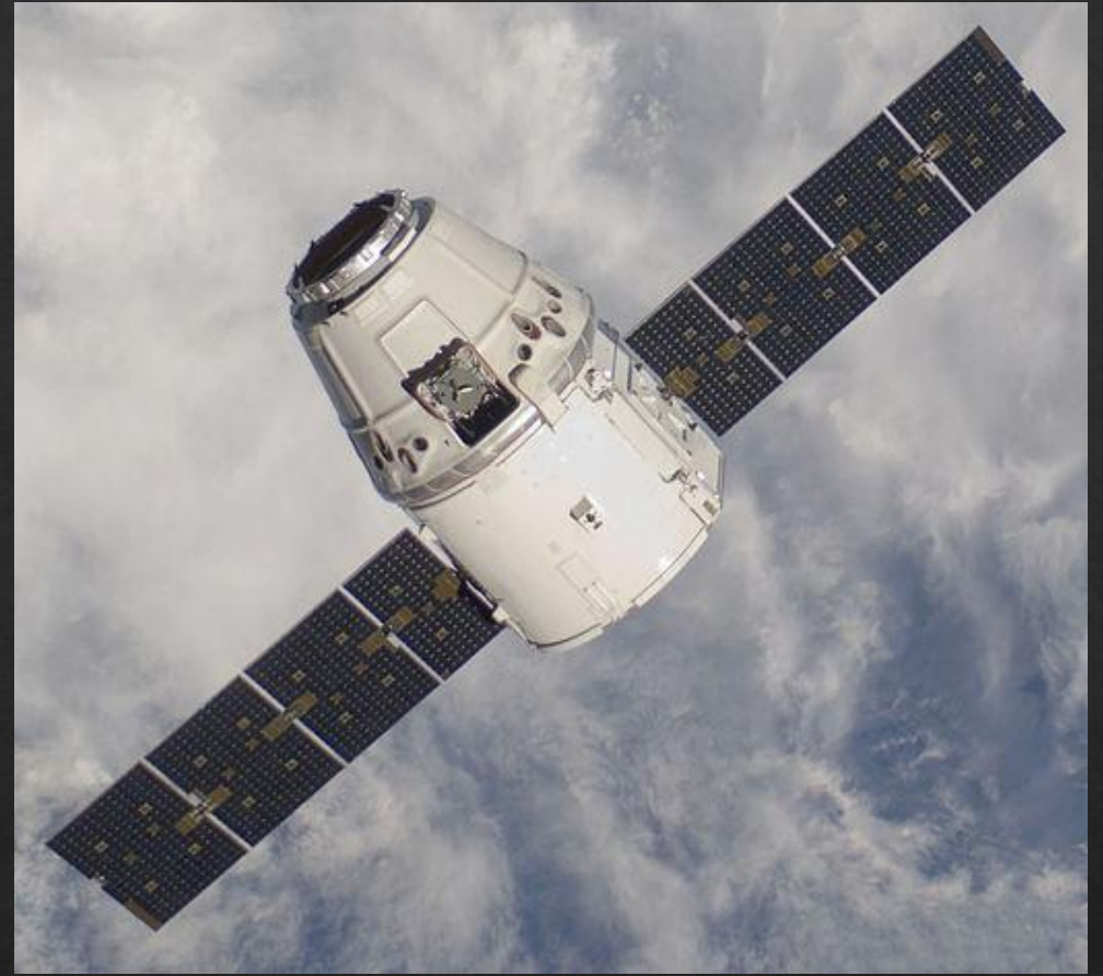
Resupply mission. The International Space Station