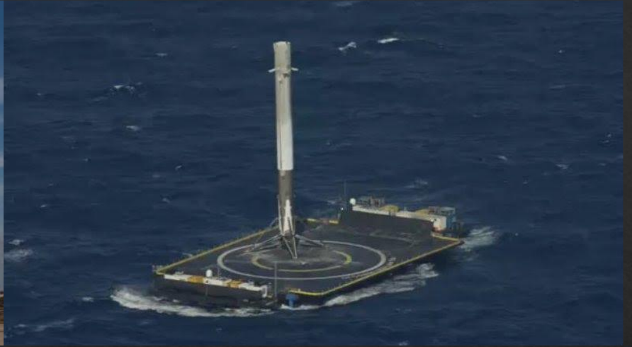
Falcon 9 booster landing