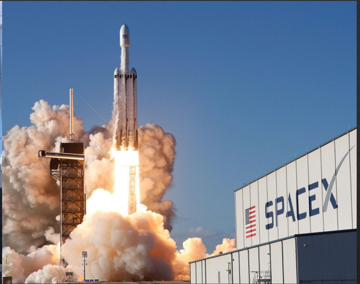
“SpaceX” office and launch pad.