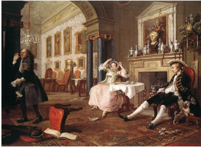
W. Hogarth, “The marriage a-la Mode”