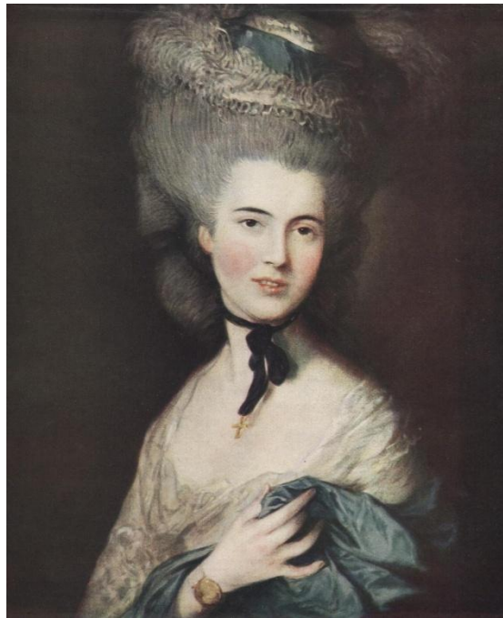
Gainsborough Thomas “Woman in Blue”