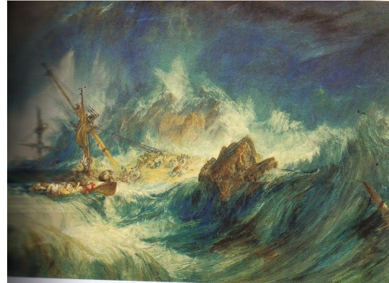
W. Turner “A storm becomes”