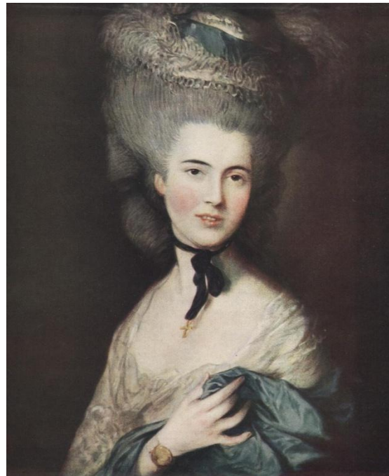
Gainsborough Thomas "Woman in Blue"