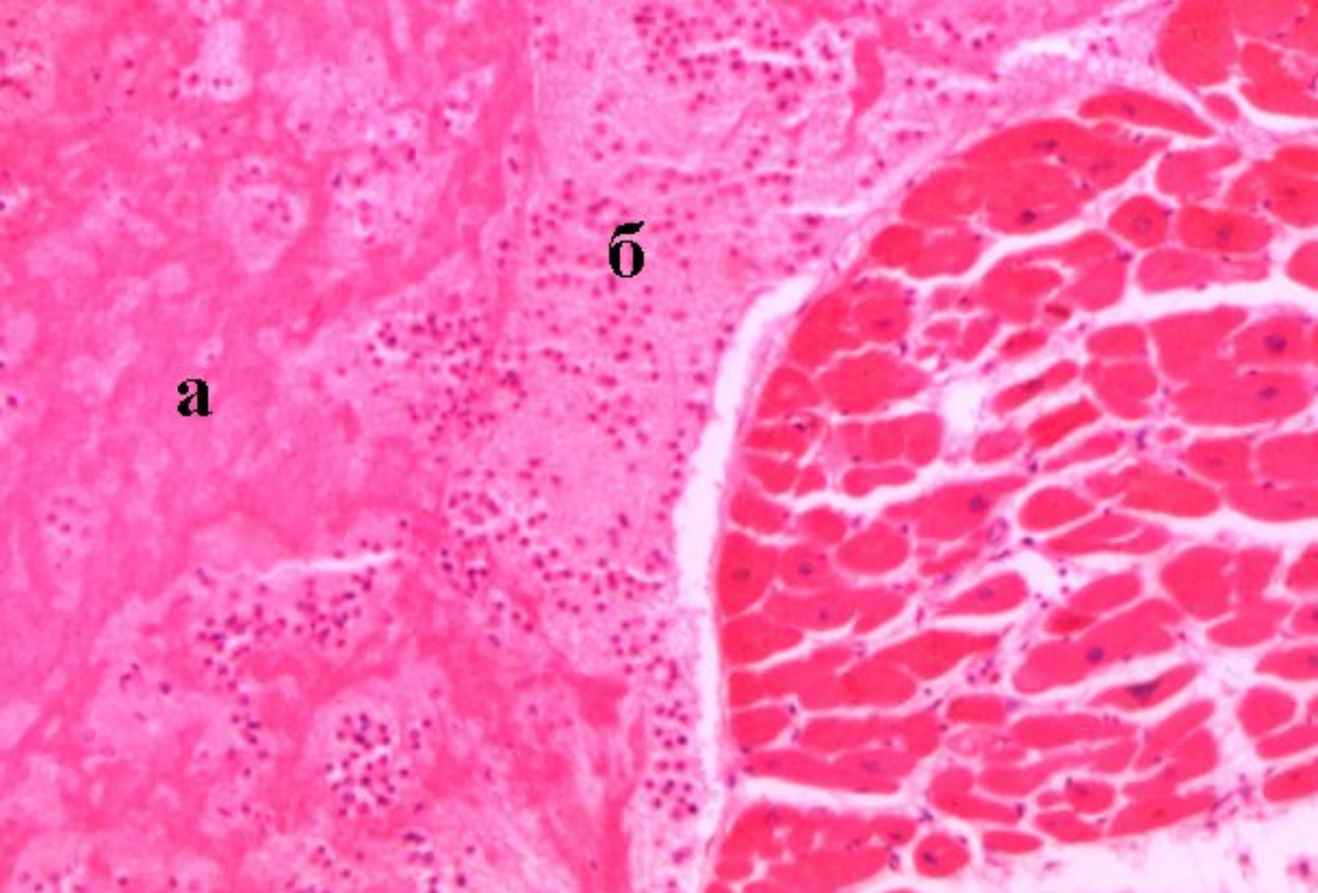
Myocardial infarction a – zone of necrosis; б – leucocytic infiltration