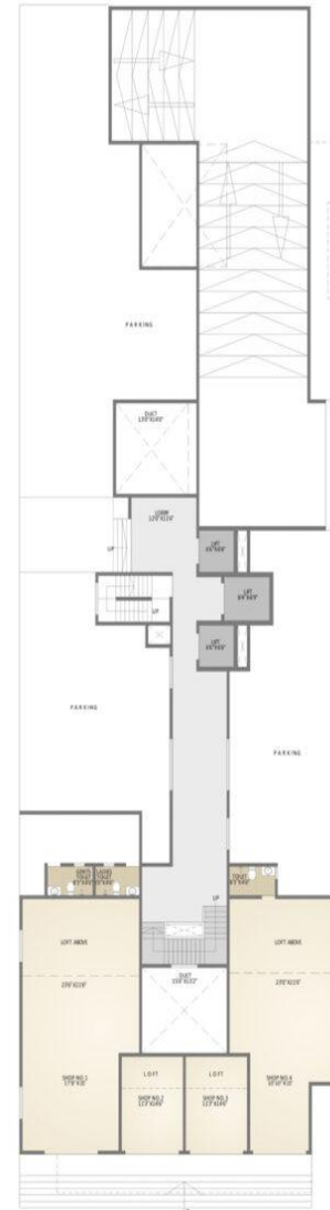
SHOP NO. 1

Shop Area: 769 sq.ft. Lift Area: 251 sq.ft. Total Area: 1020 sq.ft.