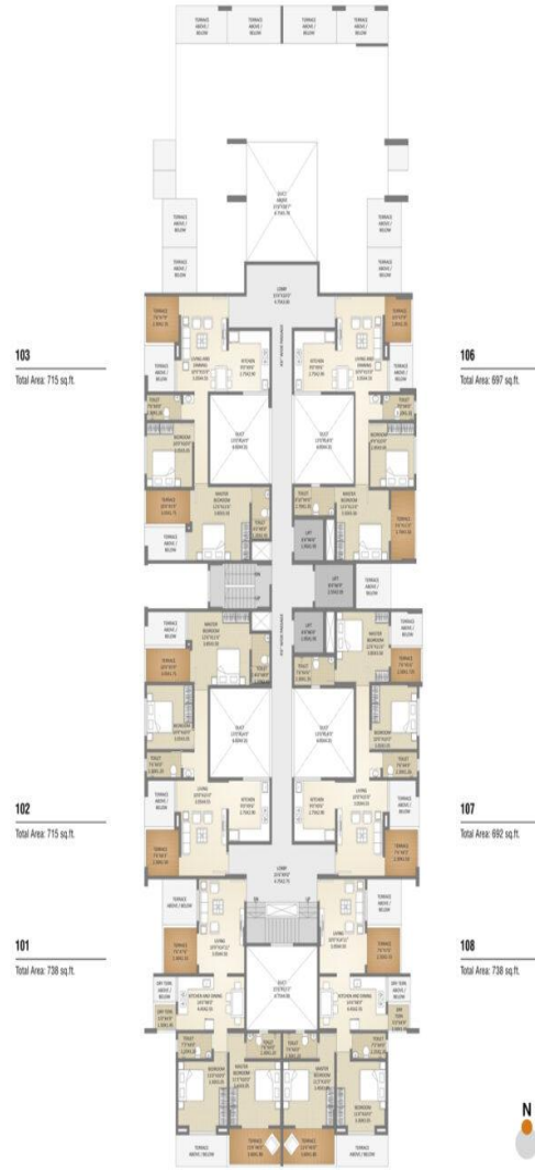
TYPICAL (2 ND , 4 TH ) FLOOR PLAN BUILDING A