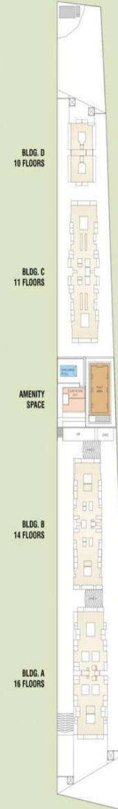
BLDG. D 10 FLOORS