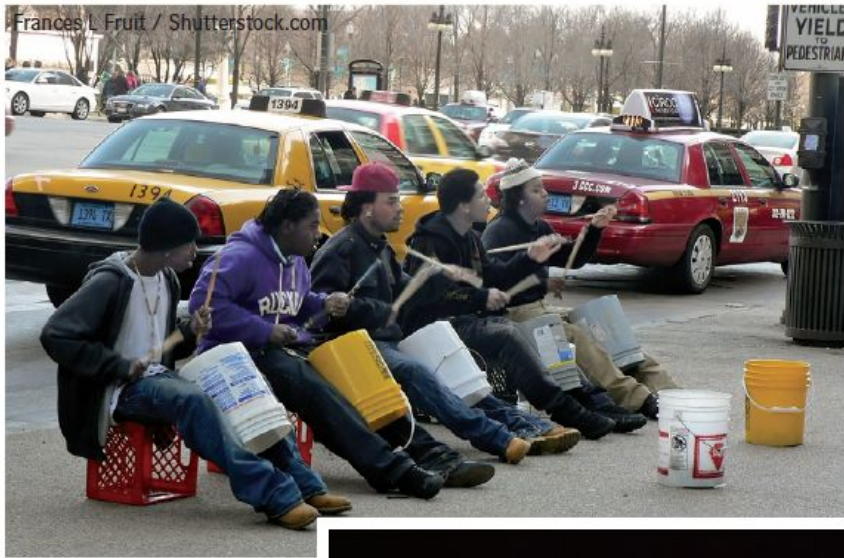
◀ a group of people performing on the street