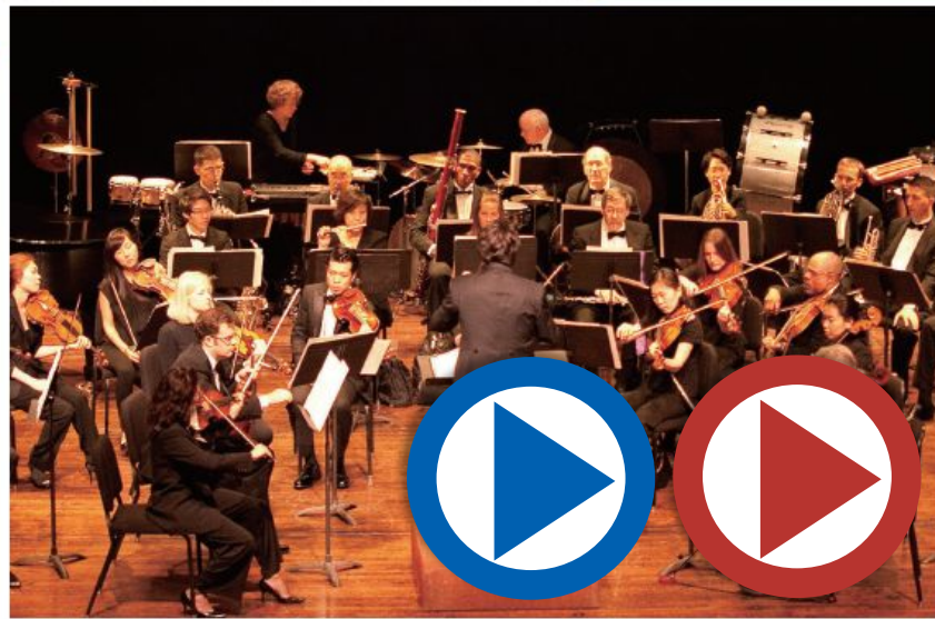
▶ an orchestra performing at a concert hall