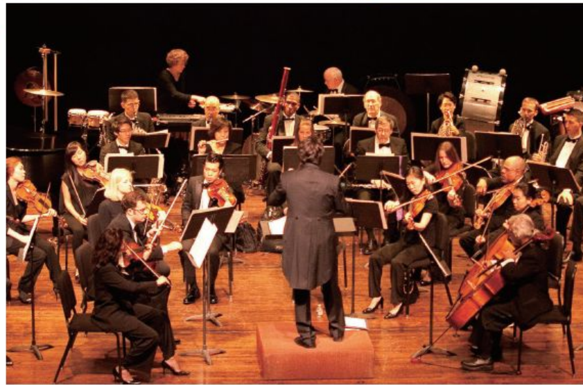
▶ an orchestra performing at a concert hall