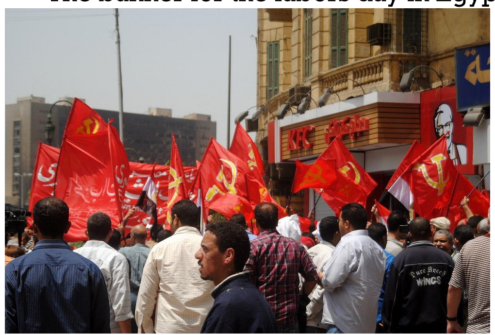
The communist protest in 2011