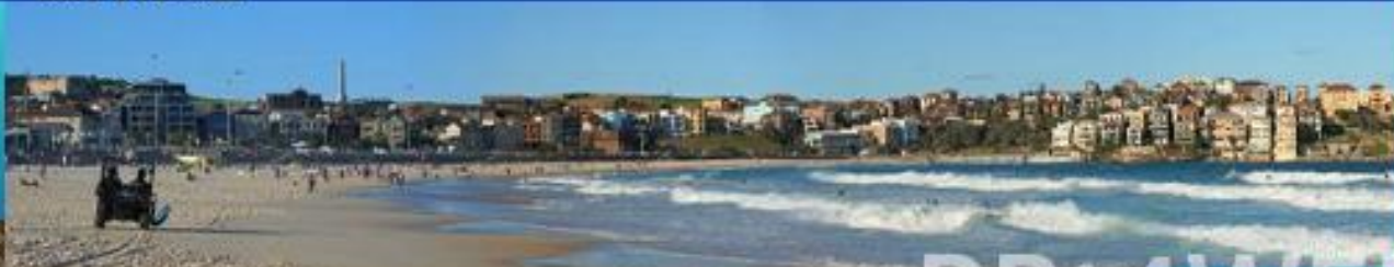
The World Famous Bondi Beach on a Winter Day