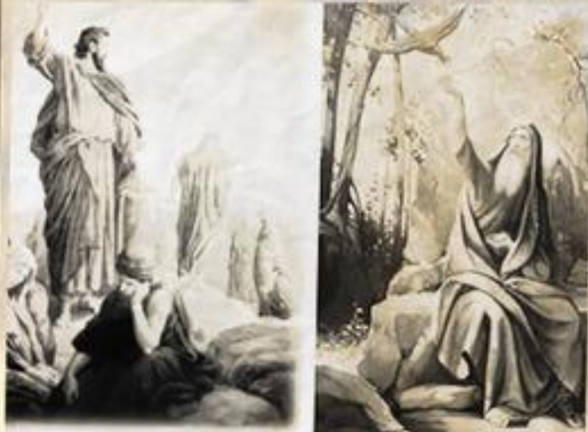
A STAR IS BORN - Point Pleasant Beach residents David and Cassie Palmer get a sneak preview of the inaugural edition of The Ocean Star while relaxing on the boardwalk. The Ocean Star , published weekly on Friday, will report all the local news from the northern Ocean County communities of Bay Head, Point Pleasant, Point Pleasant Beach and Mantoloking.

BASEBALL Gulls near top of division, page 21. SOFTBALL Point Boro Panthers stop Rumson, page 21. TRACK Point Boro track results, page 25.