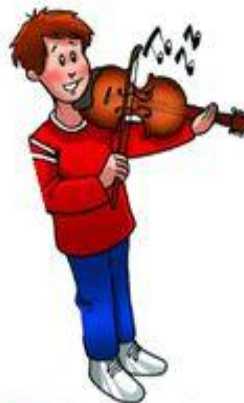
playing the violin