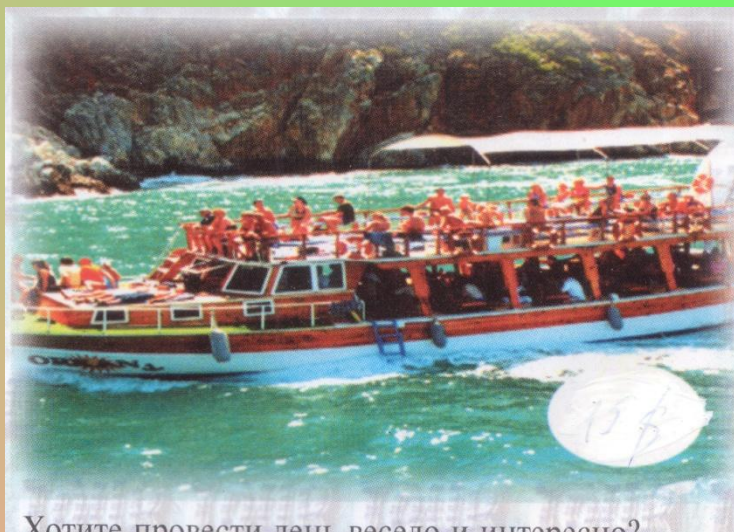
Хотите провести день весело и интересно?