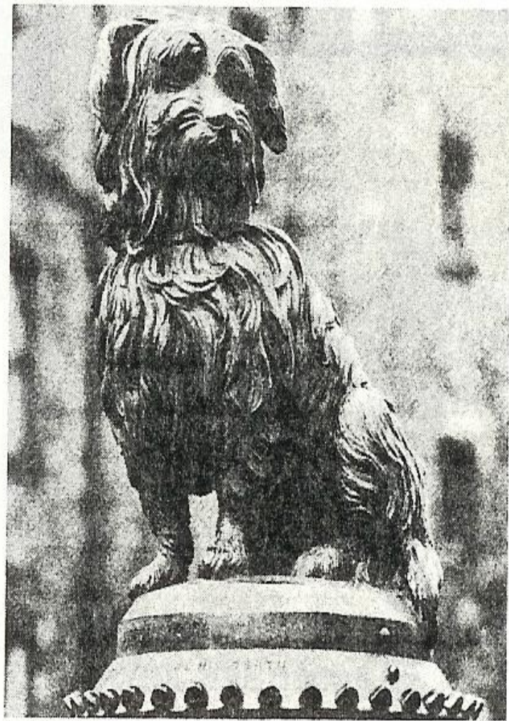
The Statue of Bobby

Bobby died more than 100 years ago, but he is still famous. Every year thousands of tourists go to Edinburgh to see Bobby's grave and his statue.