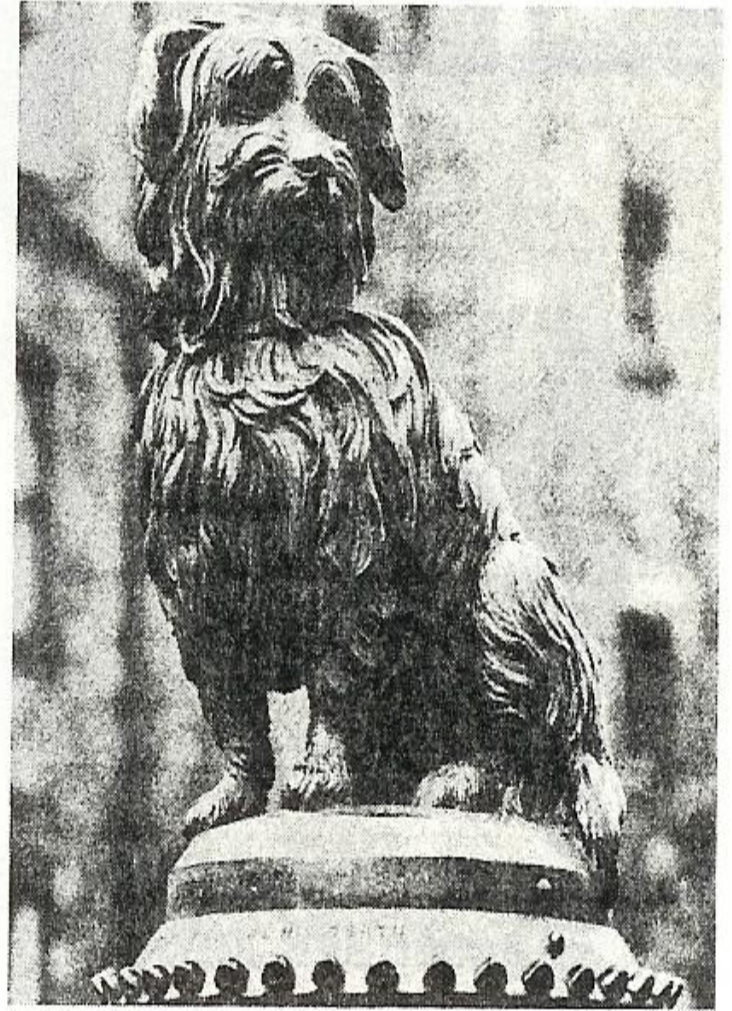
The Statue of Bobby

Bobby died more than 100 years ago, but he is still famous. Every year thousands of tourists go to Edinburgh to see Bobby's grave and his statue.