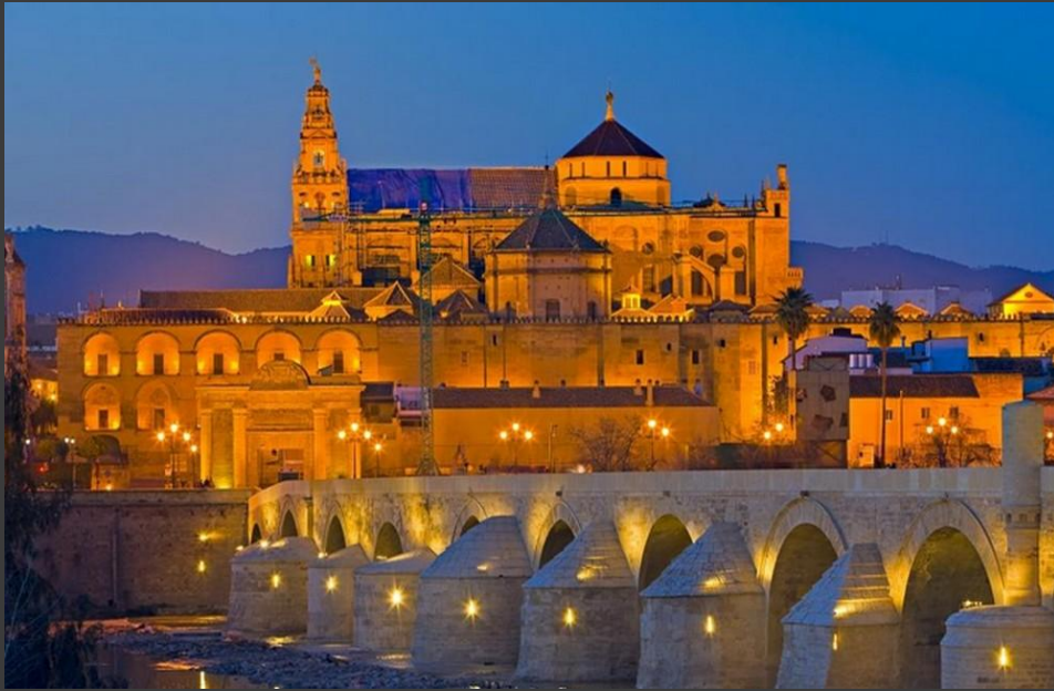
Cathedral Mosque of Mesquita