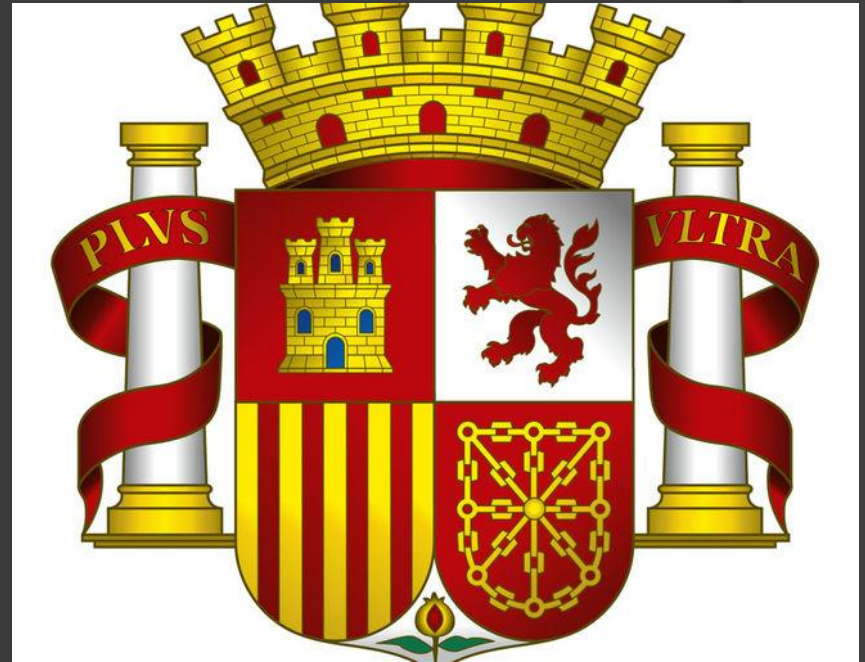
Coat of arms