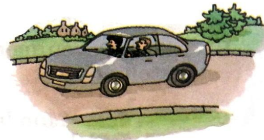
c) Mr Black