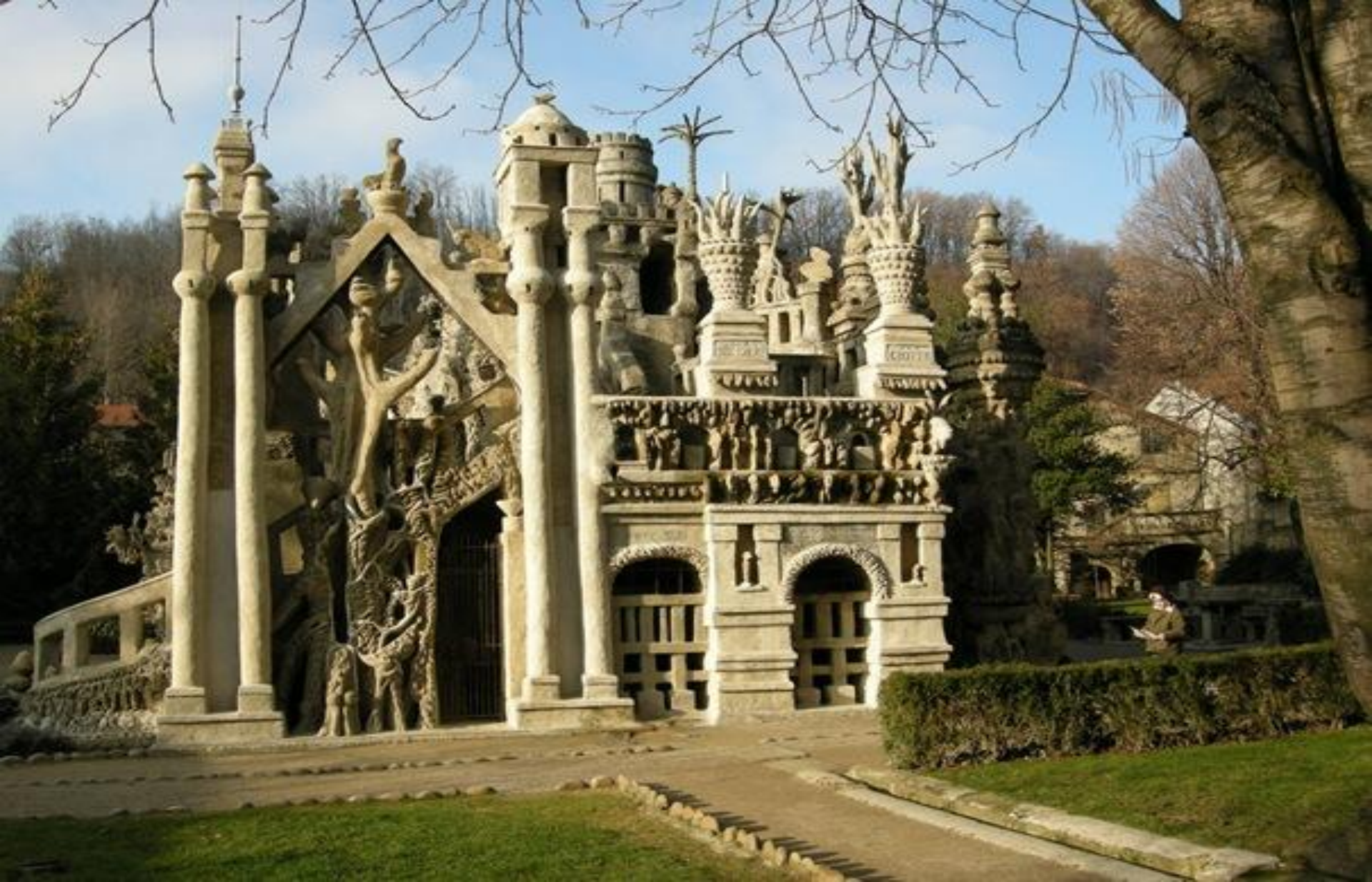
4. Ferdinand Cheval Palace a.k.a Ideal Palace (France)