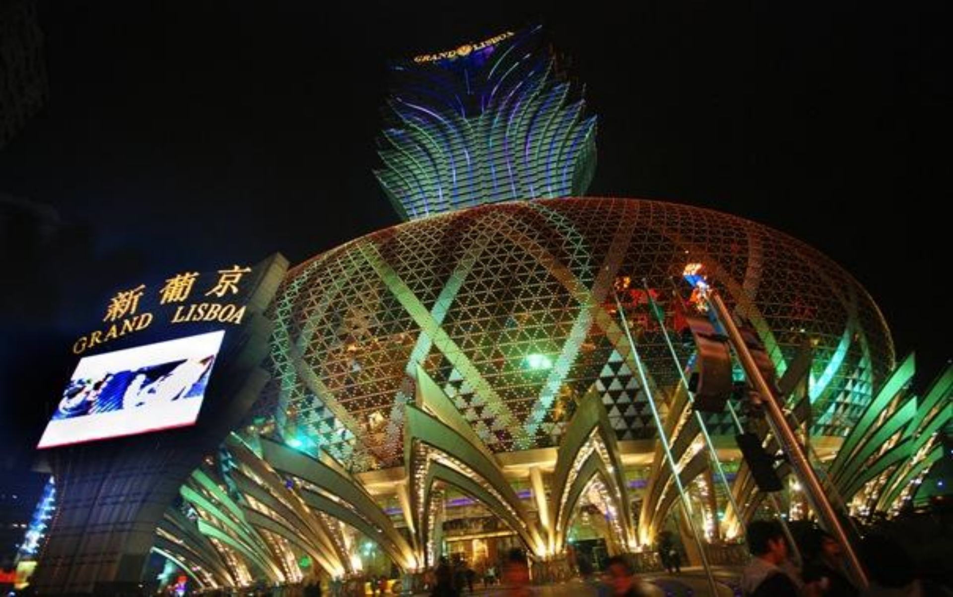
25. Grand Lisboa (Macao)