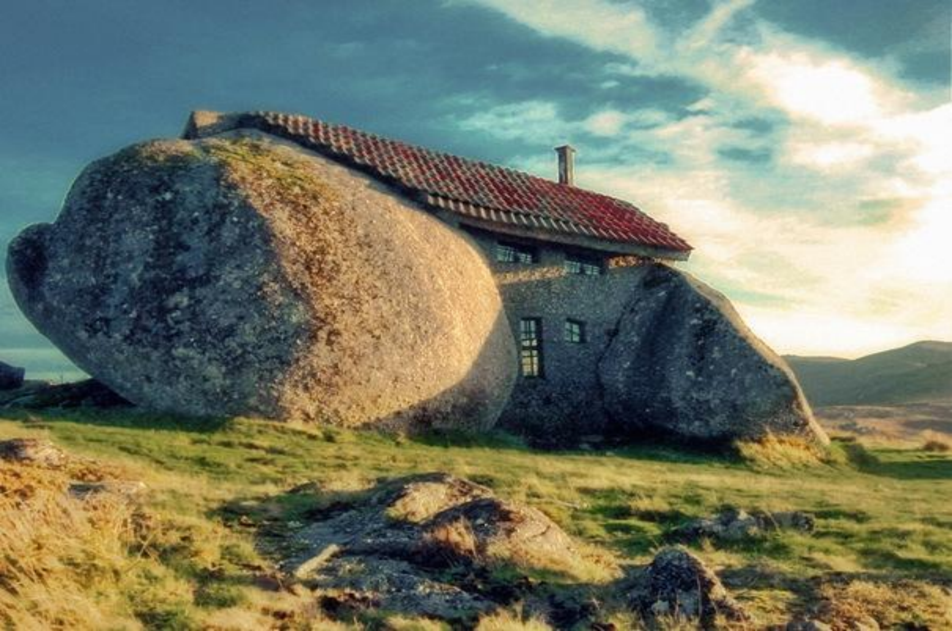
18. Stone House (Guimarães, Portugal)