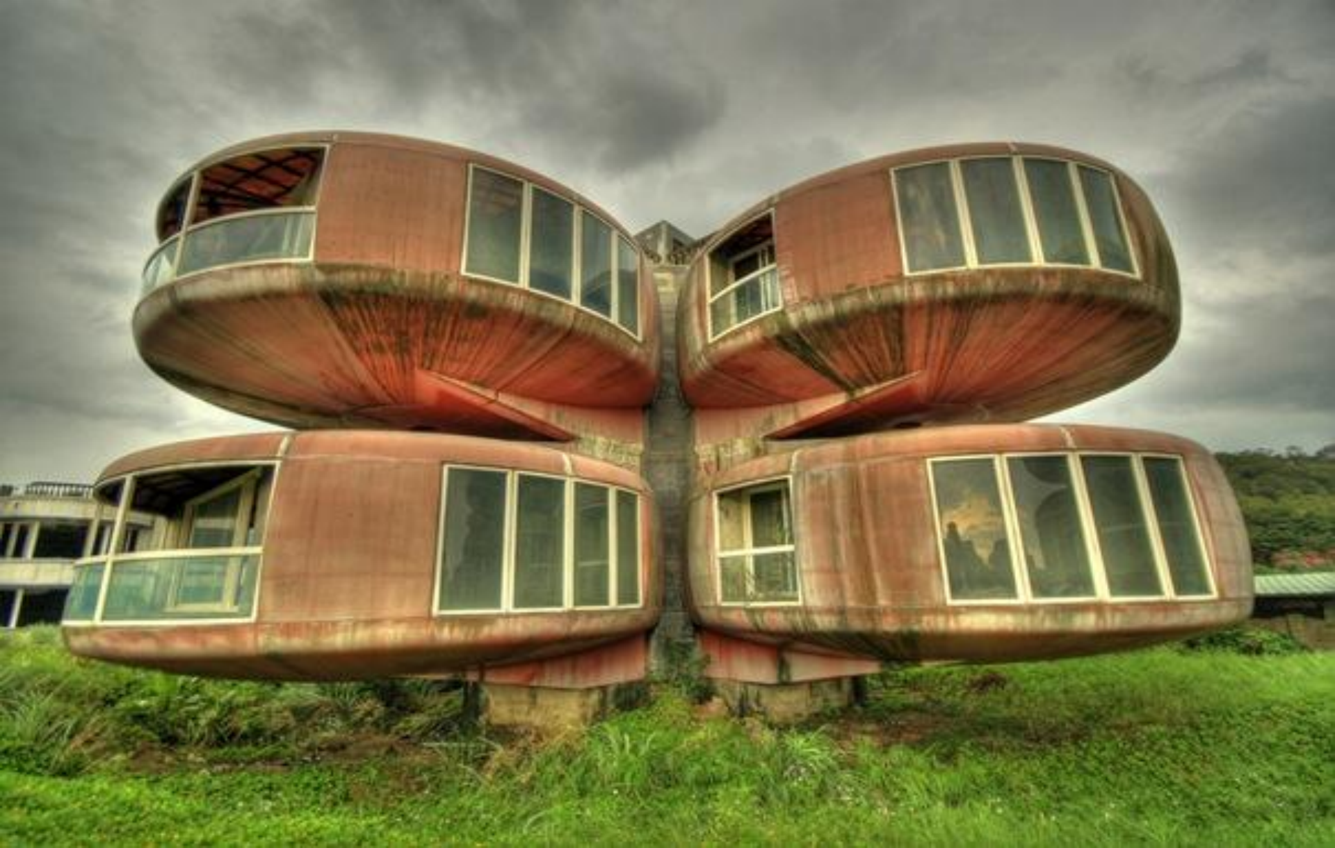
21. The Ufo House (Sanjhih, Taiwan)