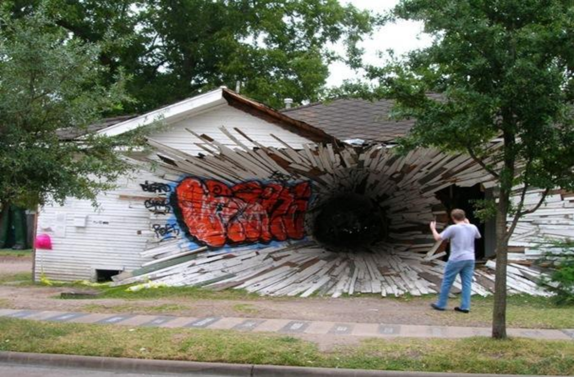
22. The Hole House (Texas, United States)