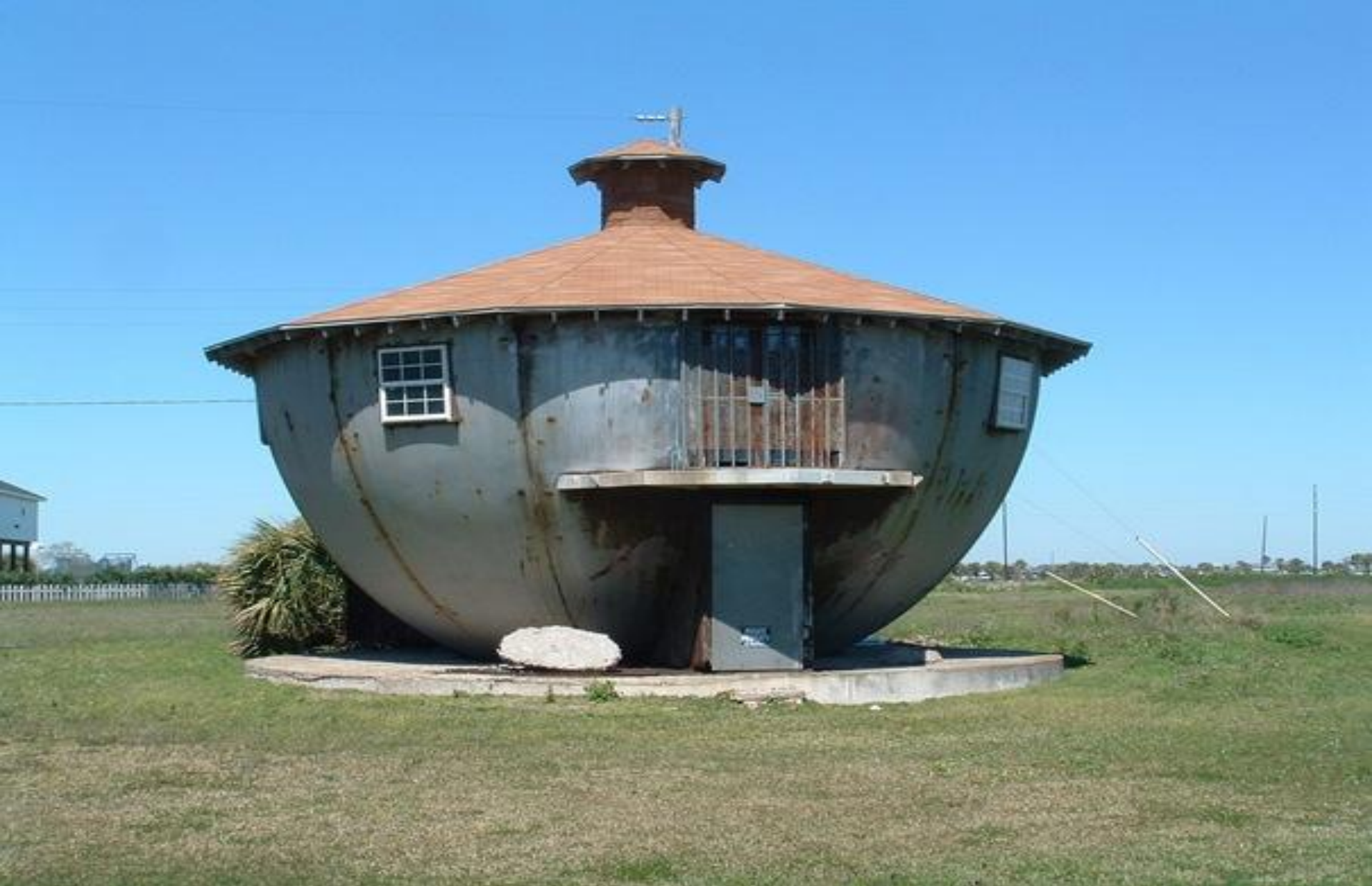
14. Kettle House (Texas, United States)