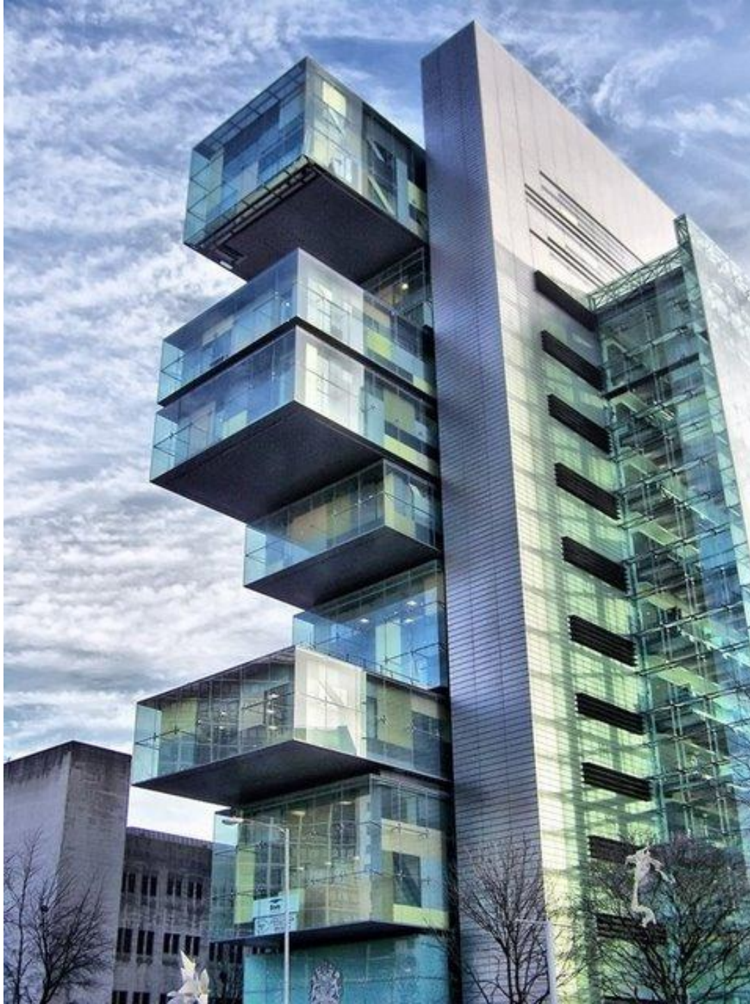
15. Manchester Civil Justice Centre (Manchester, UK)