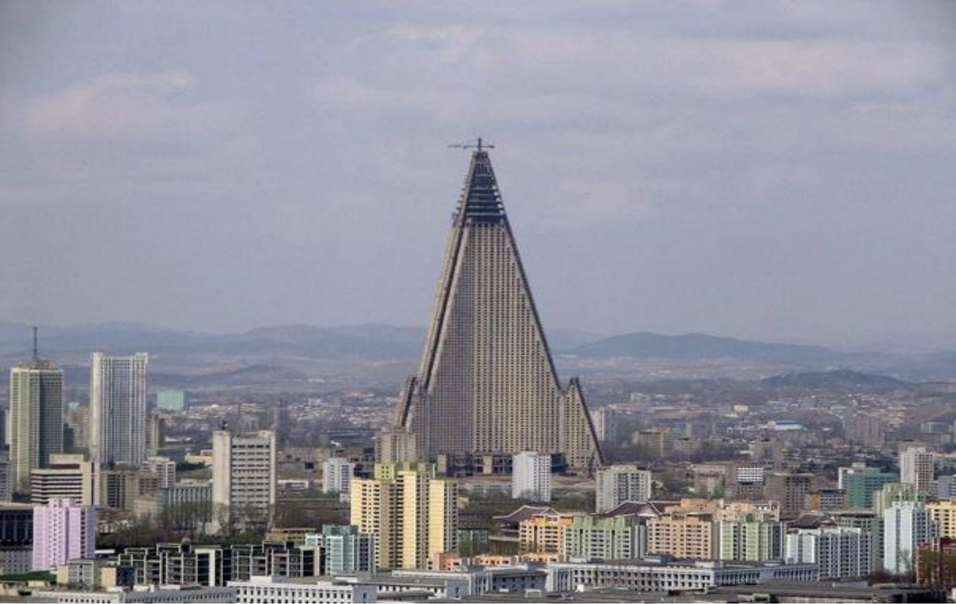
23. Ryugyong Hotel (Pyongyang, North Korea)