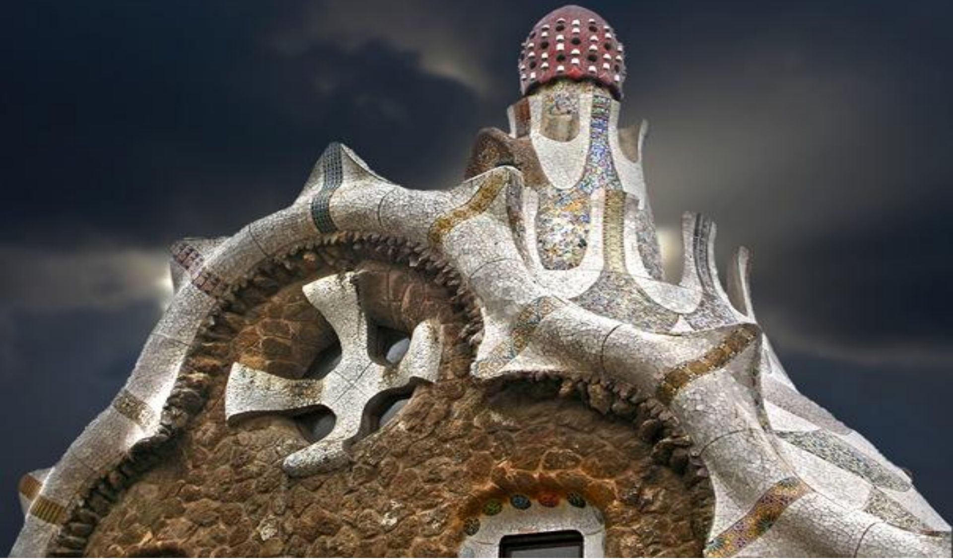
17. Mind House (Barcelona, Spain)