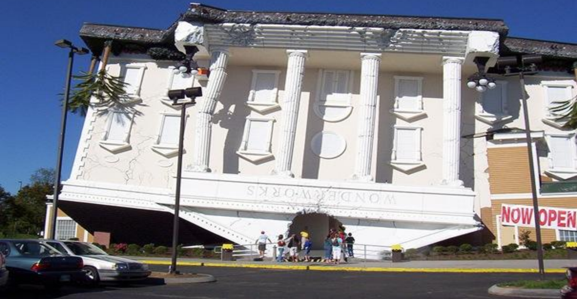
7. Wonderworks (Pigeon Forge, TN, United States)