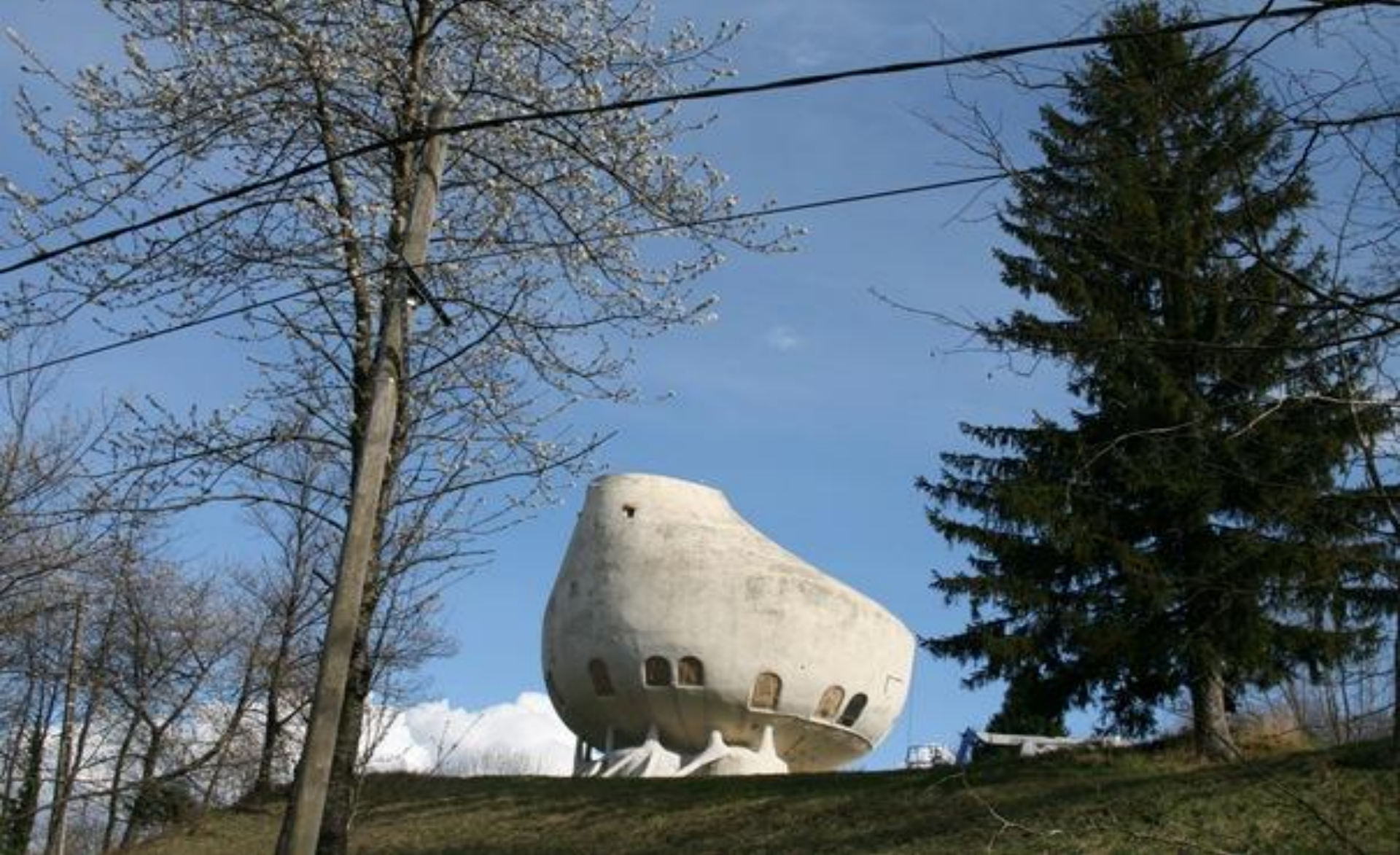
20. Weird House in Alps