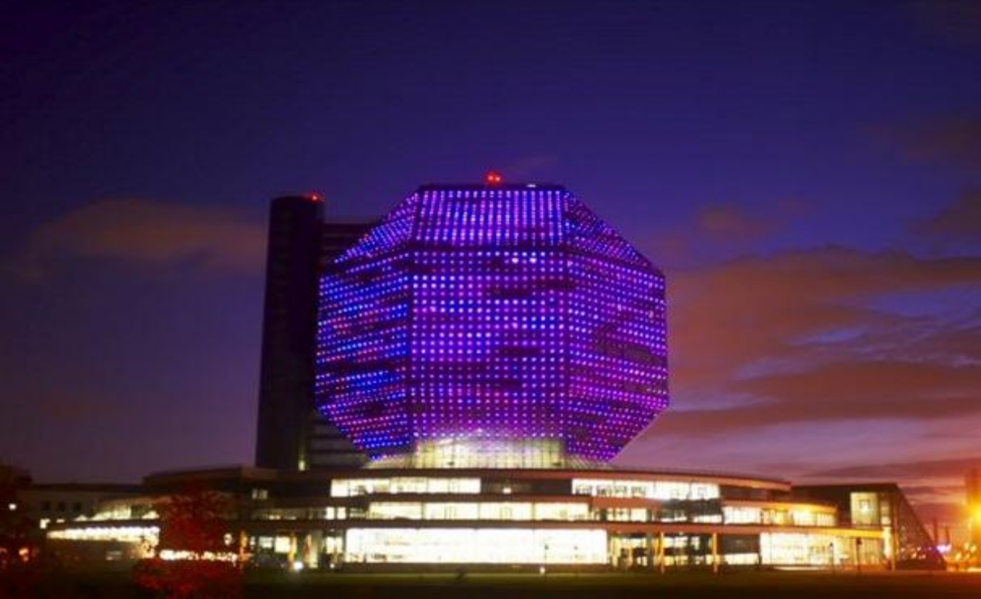
24. The National Library (Minsk, Belarus)