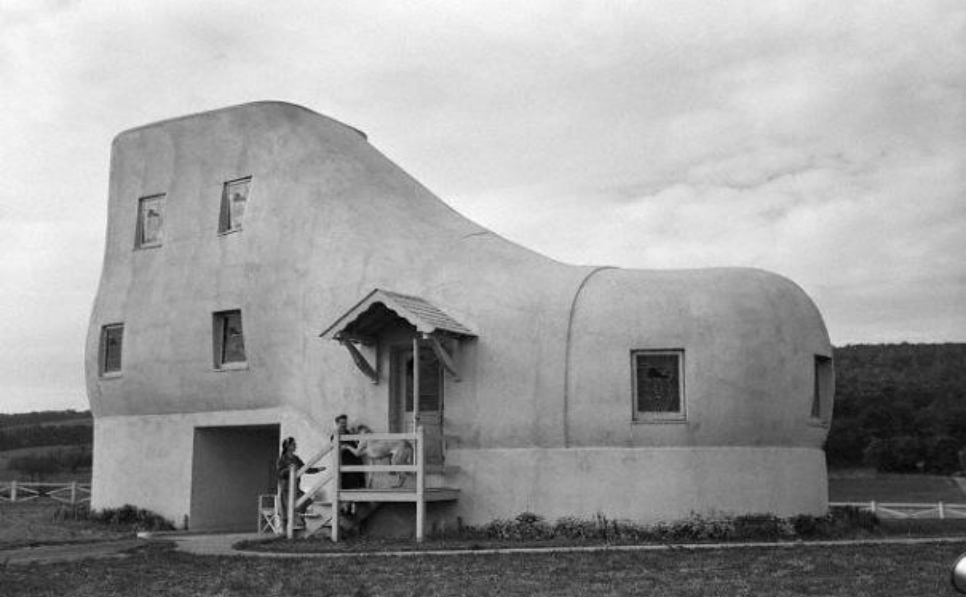
19. Shoe House (Pennsylvania, United States)