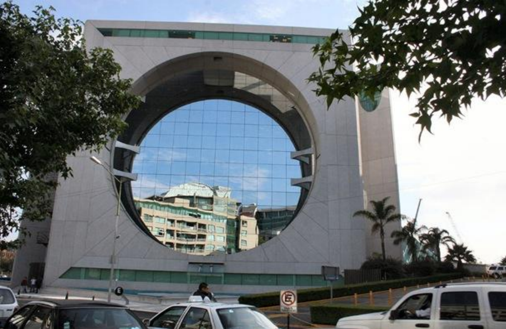
13. Calakmul building a.k.a La Lavadora a.k.a The Washing Mashine (Mexico, Mexico)