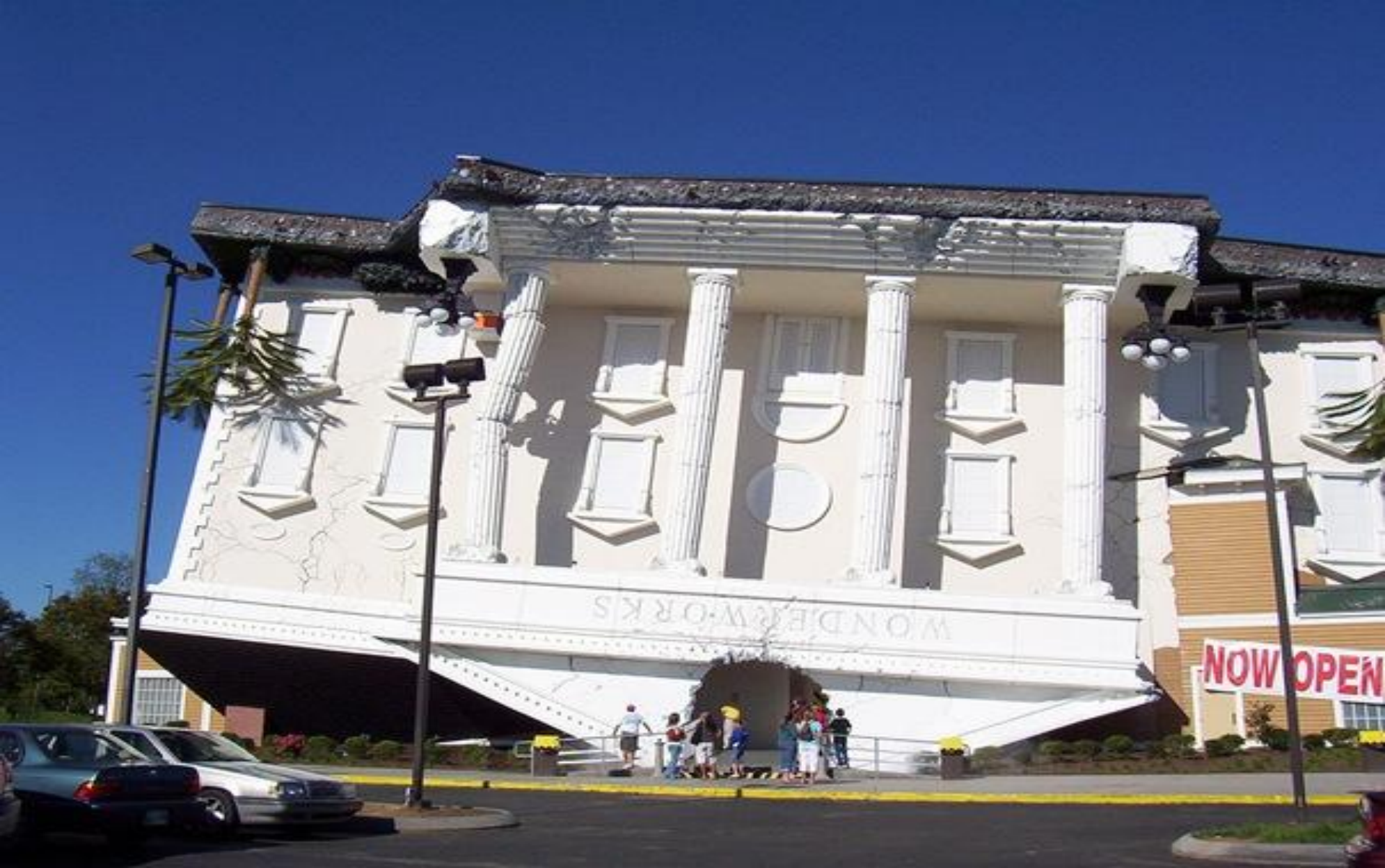
7. Wonderworks (Pigeon Forge, TN, United States)