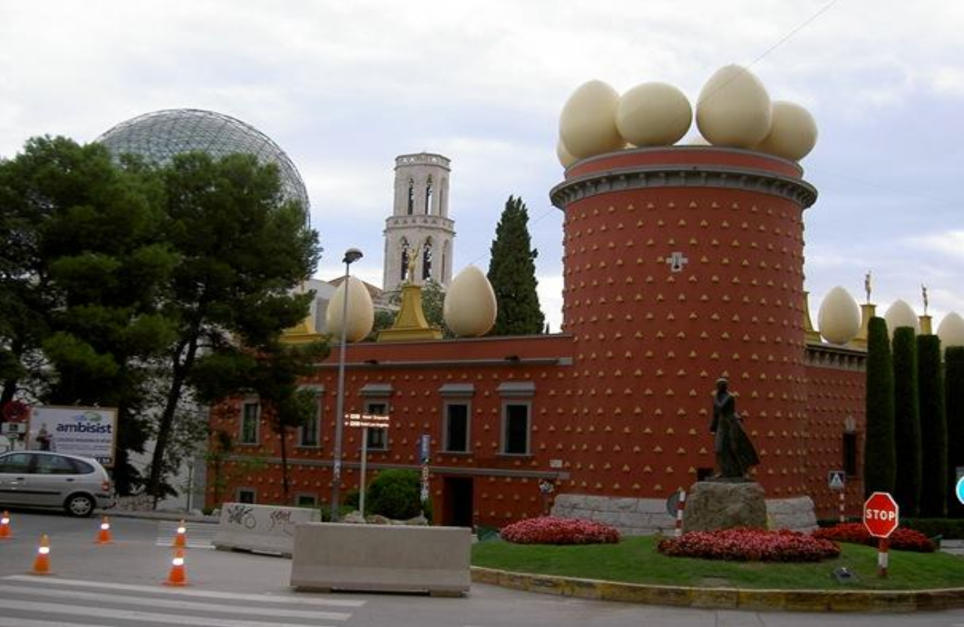
3. The Torre Galatea Figueras (Spain)