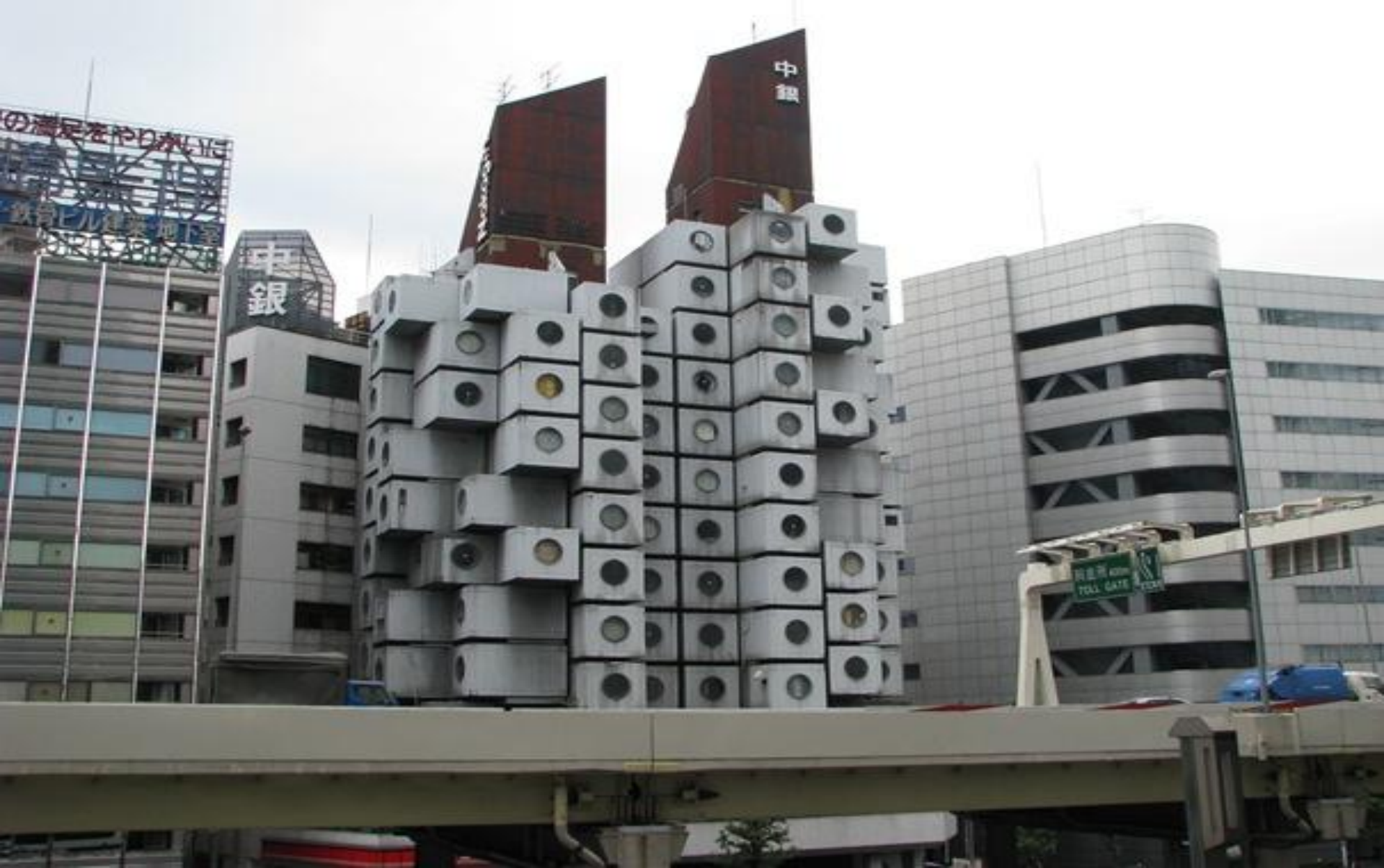
16. Nakagin Capsule Tower (Tokyo, Japan)