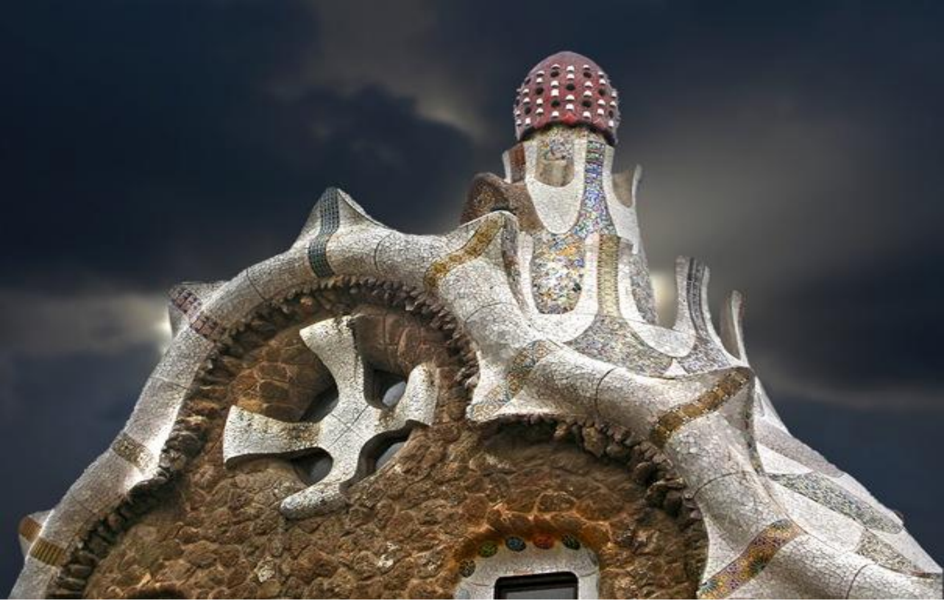
17. Mind House (Barcelona, Spain)