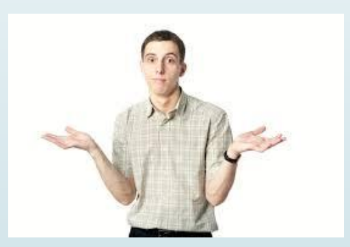
I don't know. I haven't tried it.